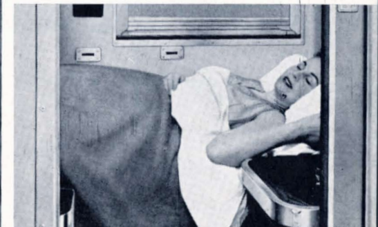
Private low-cost room in Slumbercoach

You see rugged, snow-capped peaks soaring high above you . . . white water tumbling through evergreen forests far below. Stretching out before you, and all around you, there's a broad, breathtaking panorama of mountains, plains and forests—Scenic Route