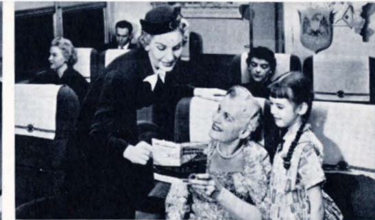
Friendly Stewardess-Nurse Service