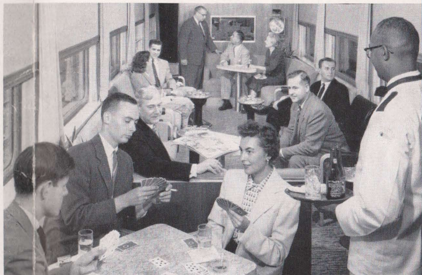
This lounge section is for the enjoyment of all the passengers. There's beverage and light snack service, magazines and newspapers, writing desk, radio and tables for cards. The lounge accommodates 32 in comfortable sofas and leather upholstered seats.

The Mainstreeter, which operates between Chicago, the Twin Cities and the North Pacific Coast, also has added another line of lightweight streamlined sleeping cars, with roomettes, duplex roomettes, double bedrooms and compartment. Modern streamlined coaches and famous Northern Pacific meals combine with the sleeping cars and Holiday Lounge to provide most satisfactory service.