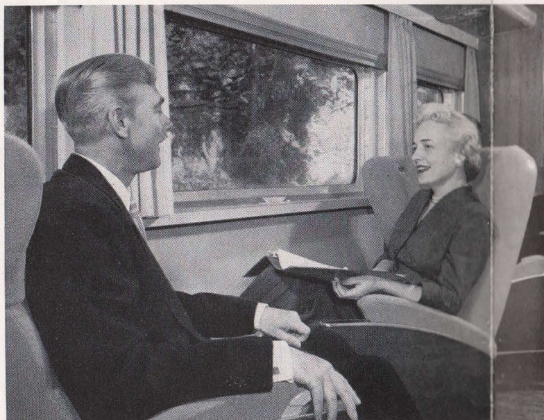
The parlor section of the new car is for the exclusive use of passengers holding first class transportation and parlor chair tickets. The deeply upholstered chairs recline and rotate and have adjustable head rests. Broad windows afford excellent view of the passing scenery.

Etchings of Northern Pacific's "Gold Spike" locomotive and other early day engines, and a replica of a pioneer locomotive headlight, shown in this corner of the lounge, are part of the decorative scheme. Planters with greenery also add an interesting touch in the lounge.