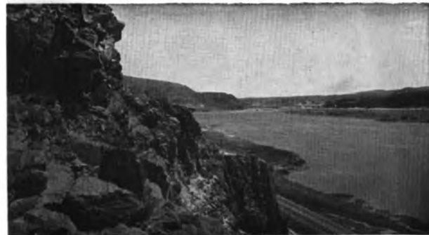
"Where rolls the mighty Oregon"—The Columbia River near Wishram, Wash.

Mt. Rainier National Park, containing 378 square miles of America's superlative mountain grandeur, is reached by motor bus from Tacoma or Seattle. There is daily service during the summer season. Mt. Rainier, an extinct volcano, arises 14,408 feet above sea level. It has the largest system of glaciers in the United States. Here is fun for all—hiking and mountain climbing, horseback riding, skiing and fishing. In Paradise Valley, Paradise Inn and Lodge provide comfortable accommodations for the visitor. An ideal side trip from Tacoma or Seattle is to go up to the Mountain one morning, spend the afternoon and overnight at Paradise Inn and return the following afternoon.