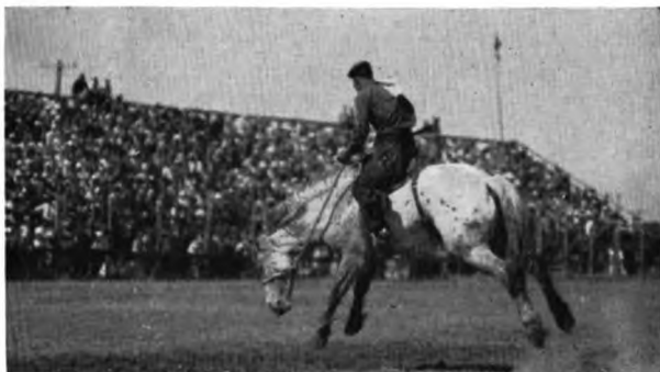
Ride 'Im Cowboy! A bit of action in the ever popular Rodeo