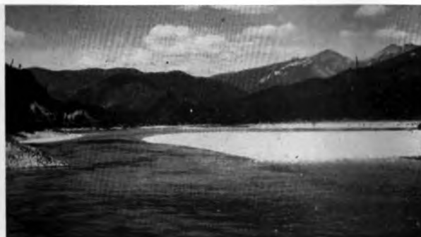
Along the Beautiful Clark's Fork River in Western Montana

Operation of trains into Glendive began August 1, 1881.