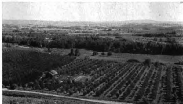
Yakima Valley produces a great variety of fruits but is particularly famous for its apples

Toppenish is in the central part of the Yakima Valley. Look a little farther to the north than Mt. Adams, from this