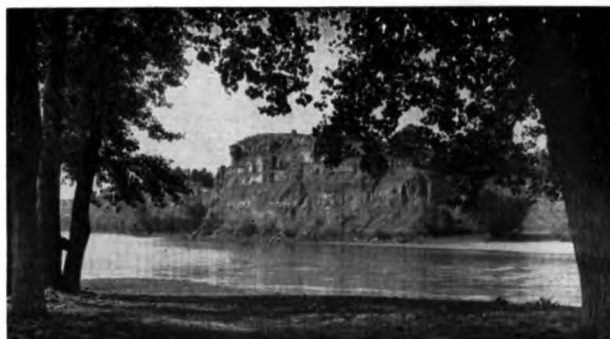
Pompey's Pillar, Lewis and Clark landmark, may be seen from the train

This is historic ground, occupied almost continuously since Lewis and Clark first visited it July 26, 1806. In 1807 Manuel Lisa, adventurous frontiersman, established a trading-post