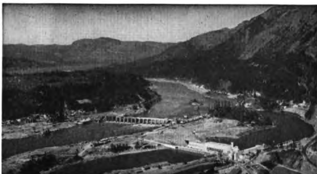
Booneville Dam, near Portland