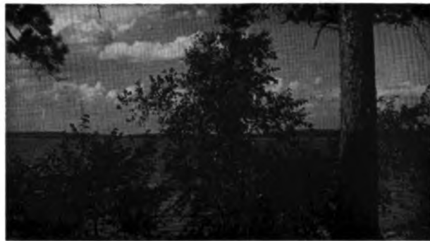
Just one of the beautiful lakes among Minnesota's more than 10,000