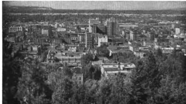
Overlooking Spokane's business district as seen from one of the city's beautiful drives

Irrigation has worked marvels all through the Spokane Valley.