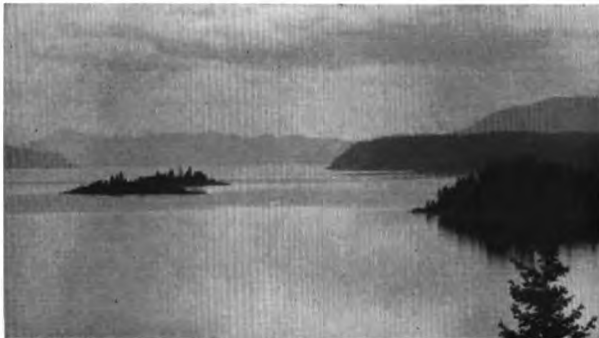
Beautiful Lake Pend Oreille, recently given national prominence as the home of huge rainbow trout

In crossing the Montana-Idaho state line the railway enters the vicinity of the Kaniksu National Forest which borders Lake Pend Oreille on the northeast.