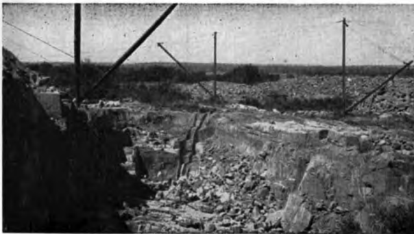
One of the many Granite Quarries at St. Cloud