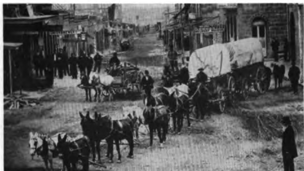
Last Chance Gulch, famous placer diggings, now Main Street of Helena

Northern Pacific lunch room at station. Box at east end of station for eastbound mail, at west end for westbound. One between baggage room and ladies' waiting room for local mail.