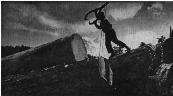
Loading logs for the mills. Nearly 50 per cent of America's timber resources lie in the Pacific Northwest