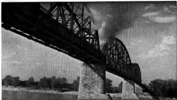
Northern Pacific bridge across the Missouri River between Bismarck and Mandan.