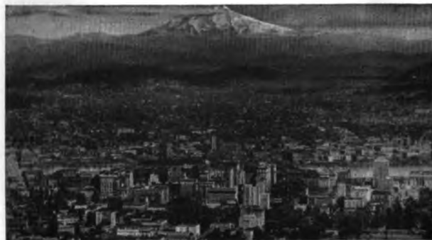
Portland, with Mount Hood in the distance

Here is located one of the largest pulp and paper mills in the world.