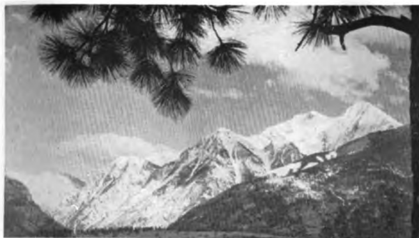
Mission Range—one of the most spectacular in the American Rockies

This is the changing point between mountain and Pacific time. Between Dixon and Paradise is a remarkable view of the Mission Range, including its highest summit, McDonald