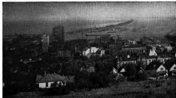
Part of Duluth and famous Boulevard Drive of the "Summer City of the Continent"

Westbound passengers from St. Paul-Minneapolis turn to page 9.