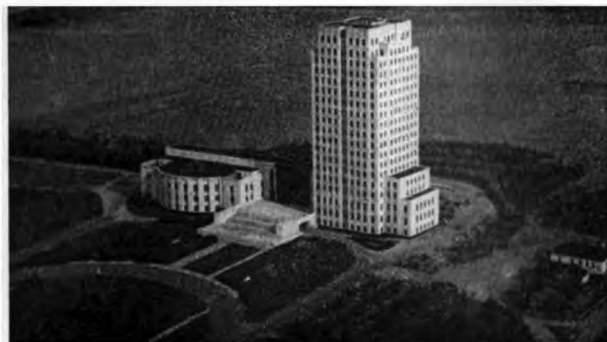
New State Capitol of North Dakota at Bismarck