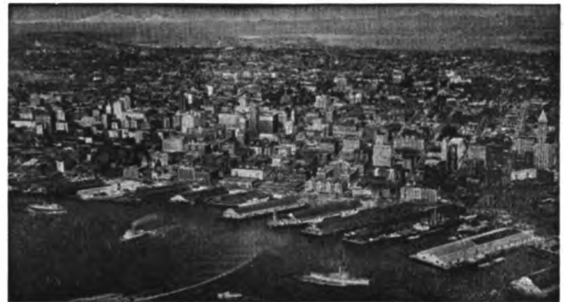
Seattle waterfront and skyline from Elliott Bay

The lofty Cascade range stretches an effective barrier between the Puget Sound country on the west and the higher plateau of central Washington on the east. A decided change in vegetation is noticeable on emerging from the Stampede Tunnel on the west slope. While the mountains in this vicinity are not so spectacular many beautiful views of forests and dashing rivers and occasional rugged peaks will be enjoyed from the windows of the train as it winds its way down to tidewater.