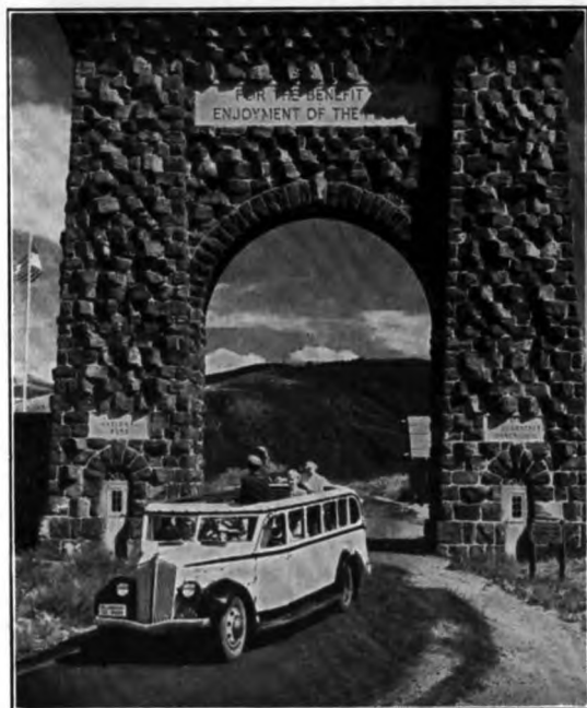
Historic Gardiner Gateway, first entrance to Yellowstone Park.

Y ELLOWSTONE, largest of the National Parks, is a wonderland of natural phenomena and scenic beauty—"the greatest show on earth."