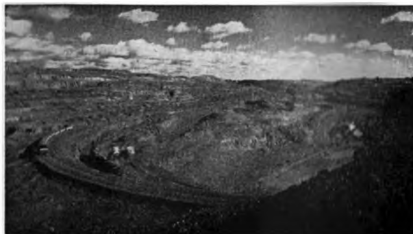
Northern Minnesota has many open pit Iron Mines

Located on the Mississippi River, Aitkin is in a typically beautiful lake region. Two hundred tributary lakes, more or less, surround Aitkin and Deerwood. They are all well