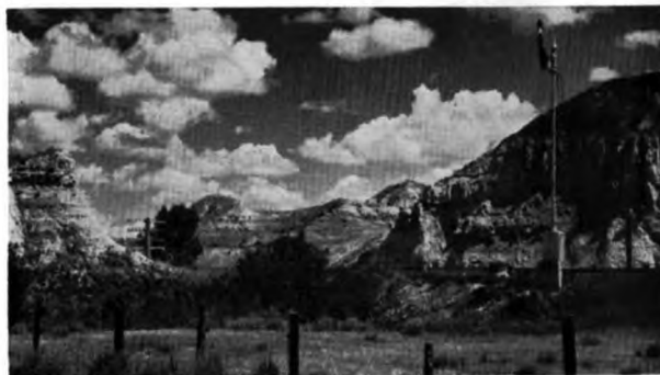
Northern Pacific trains traverse the weird, colorful Badlands of North Dakota for thirty miles

Westbound passengers should turn their watches back one hour here. Eastbound passengers should turn theirs one hour ahead.