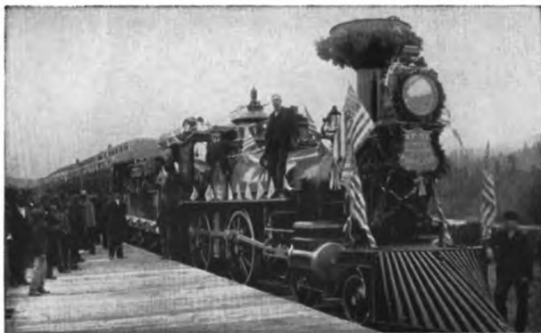
The Villard Special which made the trip to Gold Creek to take part in the Gold Spike celebration.