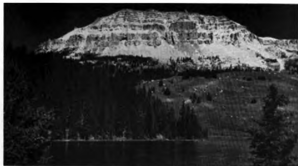
Beartooth Butte and Lake on the Red Lodge HIGH Road to Yellowstone Park