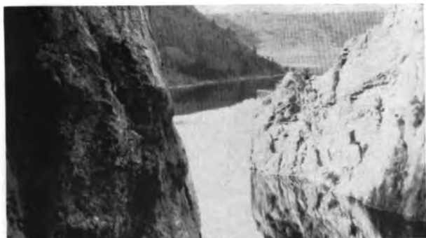
Gates of the Mountains near Helena, discovered and named by Lewis and Clark