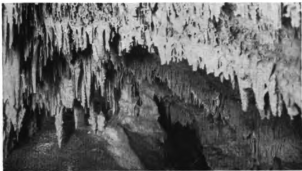
Strange and beautiful formations are found in the underground fairyland of Morrison Cave, near Whitehall