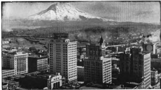
Tacoma, a great industrial and recreational center