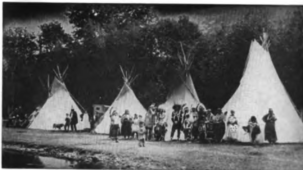
Flathead Indians often camp near the station at Arlee