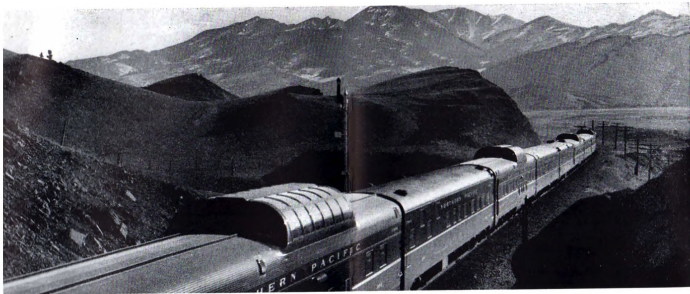
The Vista-Dome North Coast Limited in the Montana Rockies