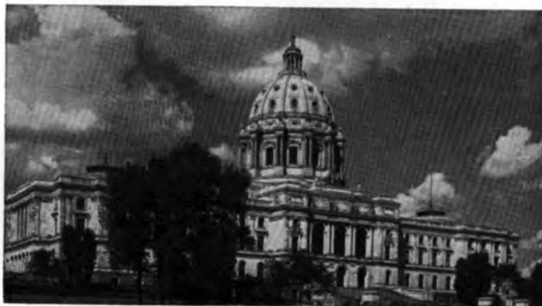
Minnesota's Beautiful Capitol Building at St. Paul

St. Paul, the capital of Minnesota, was settled in 1838. It was named for the Apostle Paul. In 1849 it became a village, in 1854, a city, and in 1858 the state capital when Minnesota was admitted to the Union. The marble State Capitol is one of America's most beautiful buildings. St. Paul is a manufacturing, wholesale and transportation center. It is served by nine railroad systems, including three transcontinental lines. Summit Avenue, the principal residence street, is an attraction for tourists as are the beautiful parks, boulevards and lakes. The Minnesota State Fair and Minnesota State Agricultural College make St. Paul a center of agricultural interest. Macalaster College, Hamline University, St. Catherine's College, Concordia College and St. Thomas College are located here. Here also are located the Northern Pacific general offices. First Northern Pacific tracks were laid in St. Paul in 1881.