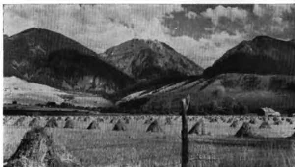
Wheat Field in Paradise Valley, Montana

The Northern Pacific Railway serves Gardiner, Red Lodge, and Cody Gateways to Yellowstone