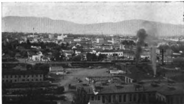
Missoula is the distributing center for Western Montana.

With prophetic vision he saw a great future in store for the northwest country and was naturally attracted to the Northern Pacific enterprise.