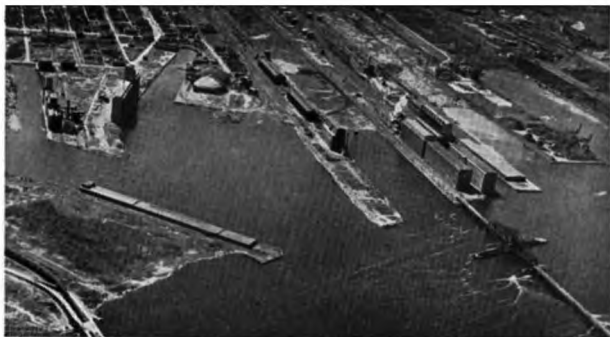
Part of the great inland harbor at Superior