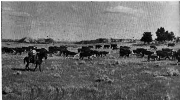
Montana range cattle being rounded up and driven to railroad for shipment to market

Completion of the Northern Pacific across North Dakota was celebrated by silver spike ceremonies one mile west of here November 10, 1880.