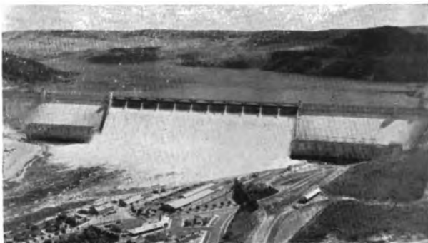
Grand Coulee Dam, near Spokane