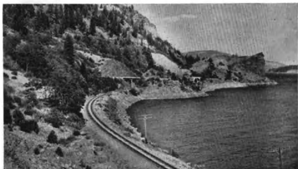
Along Columbia River near Hood, Washington