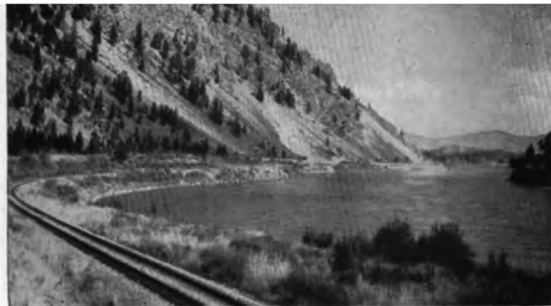
Northern Pacific rails follow the Jefferson river through Jefferson Canyon in the Montana Rockies

Here the Tobacco Root Mountains, Deerlodge National Forest, are prominent on the south and Bull Mountains, Deer Lodge National Forest, on the north (less conspicuous). West of here the railroad is on an island in the braided stream of the Jefferson River, but before Whitehall is reached (on the westward trip), the Jefferson is left behind.