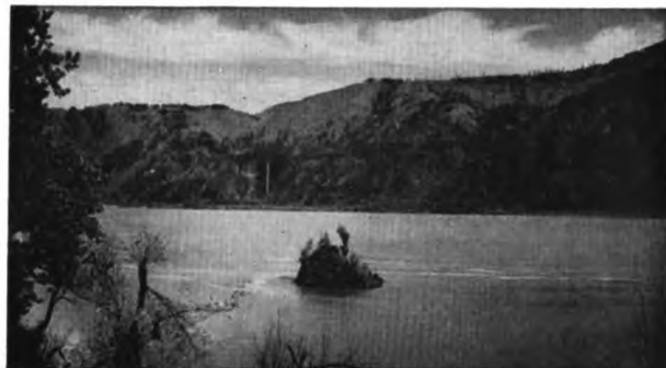
The Oregon Bluffs from across the Columbia. The fine ribbon of Multnomah Falls can be seen, left center