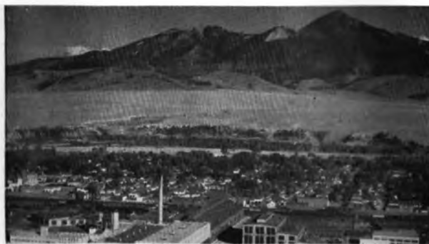
Livingston, Montana, with the high Absaroka Range to the east and N.P. shops in foreground

The region in which Columbus, Big Timber and Springdale are located is known for its splendid dude ranches, live stock, its sugar beets and its agricultural value in general.