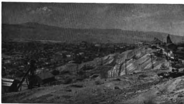
Butte, Montana, built over an underground city of countless mine shafts and tunnels