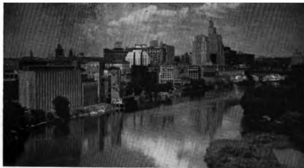
St. Paul Skyline and Mississippi River