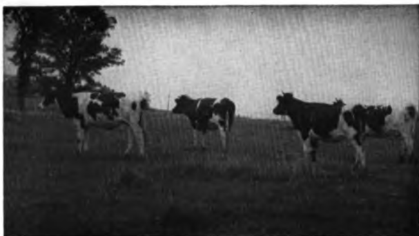
Minnesota's Dairy Herds have placed it among the leaders in production of milk and butter