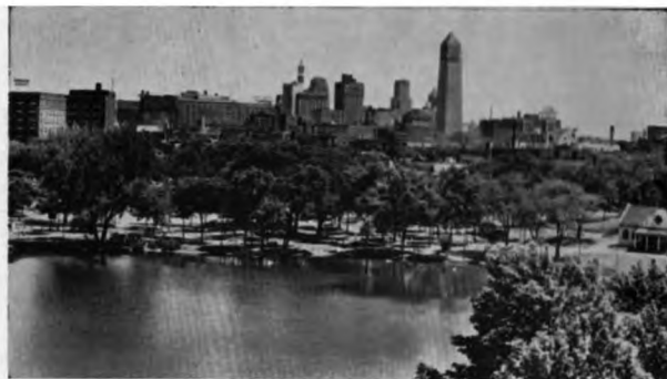
Skyline of Minneapolis as seen from one of the city's 22 lakes and lakelets

In 1883-84 the first Northern Pacific tracks in Minneapolis were constructed. St. Paul Division headquarters of the Northern Pacific are located here.