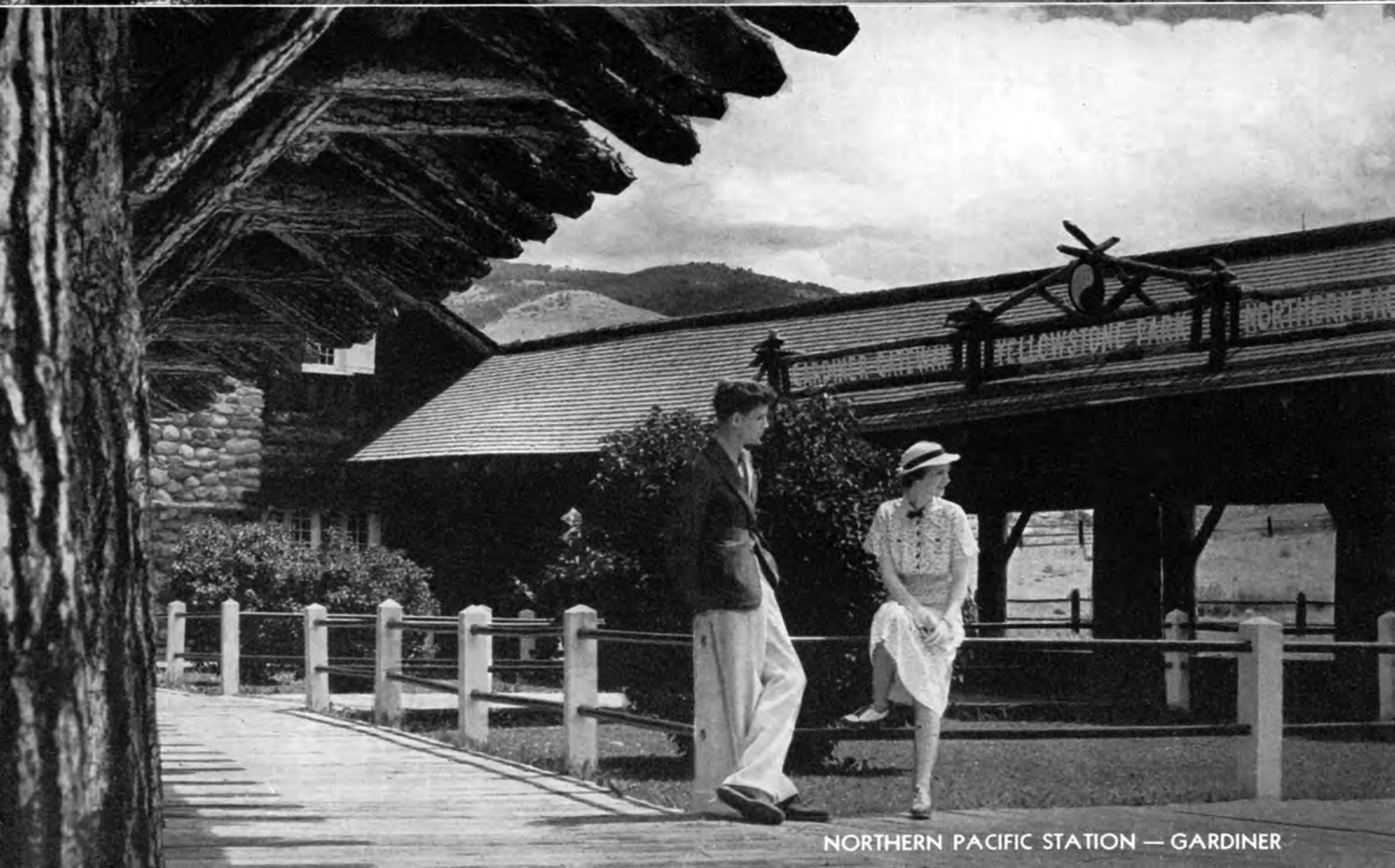
NORTHERN PACIFIC STATION — GARDINER