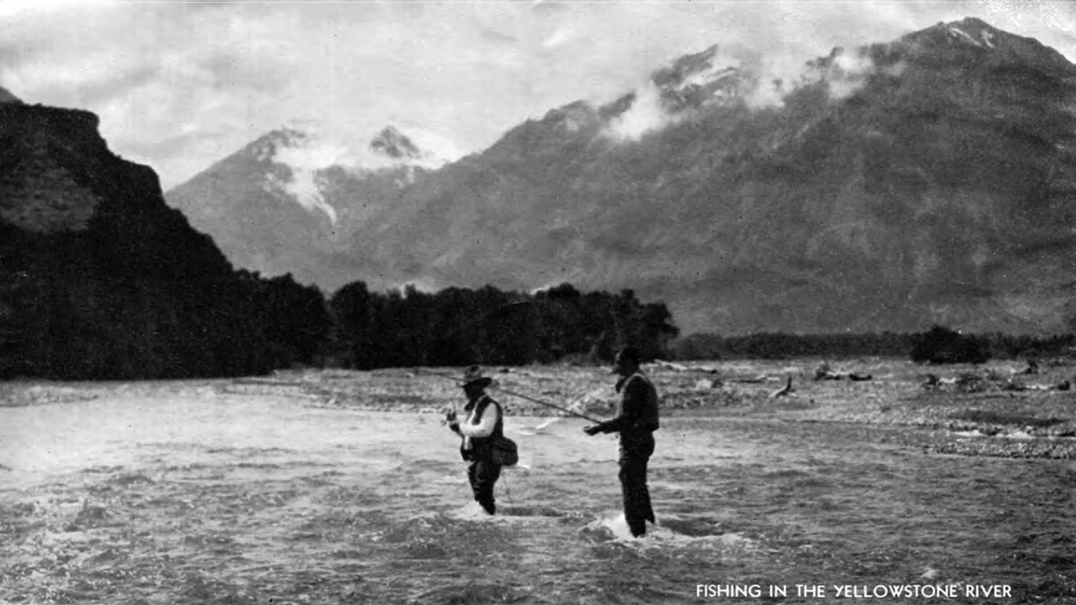
FISHING IN THE YELLOWSTONE RIVER