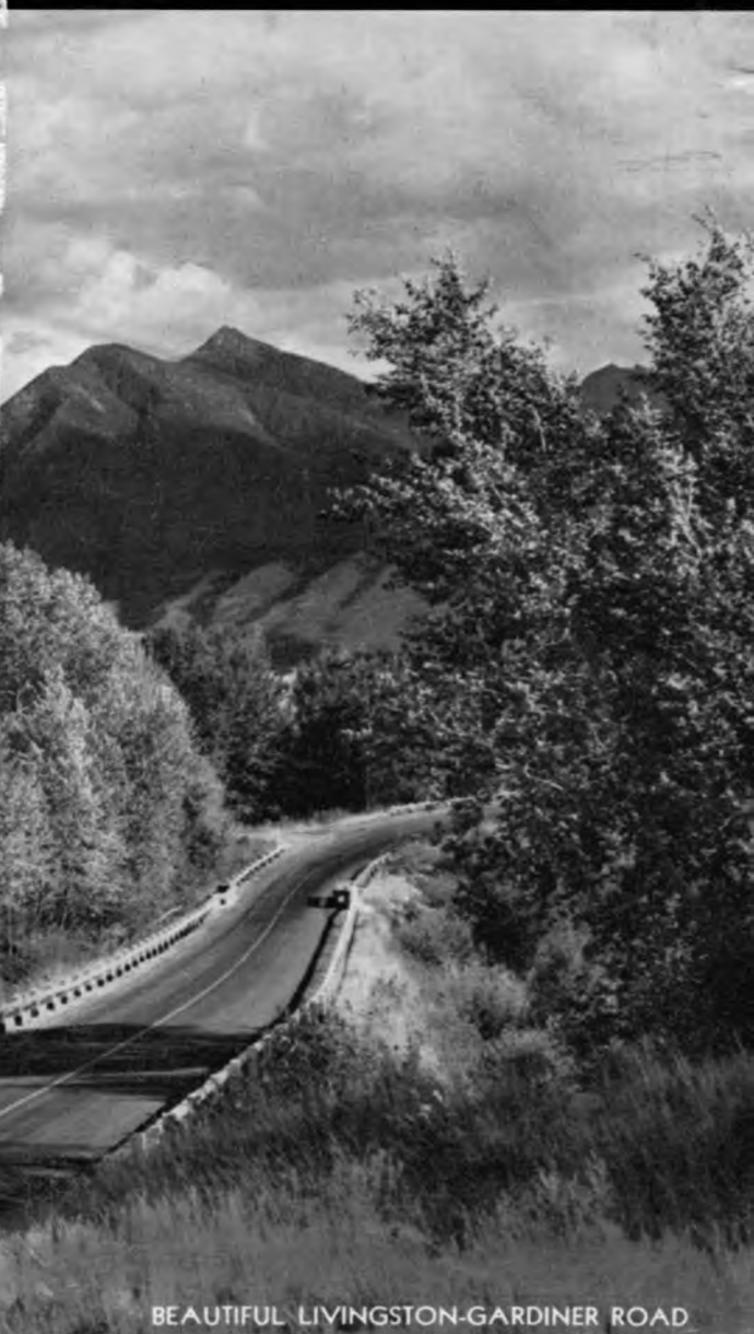
BEAUTIFUL LIVINGSTON-GARDINER ROAD