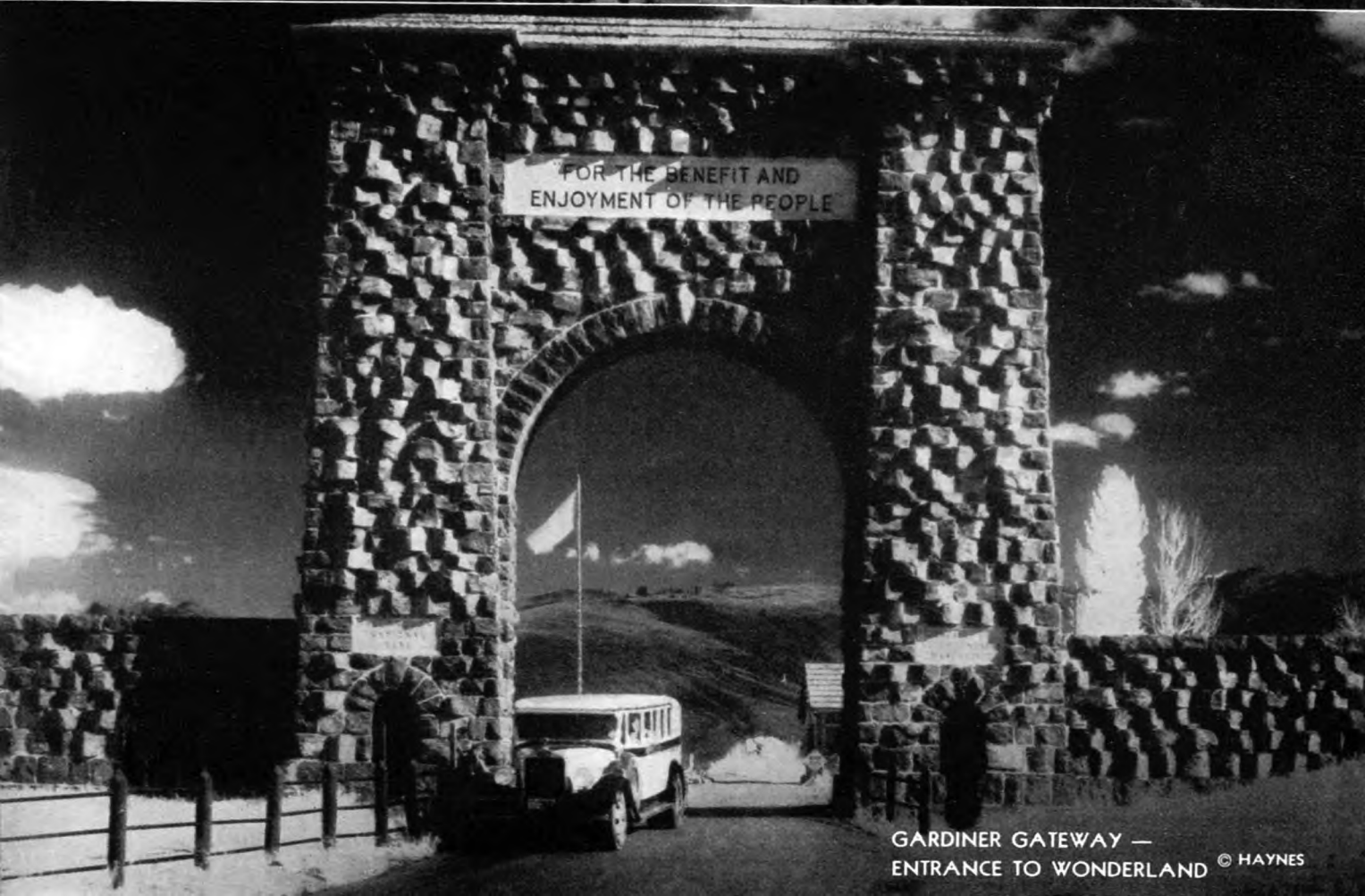
GARDINER GATEWAY — ENTRANCE TO WONDERLAND