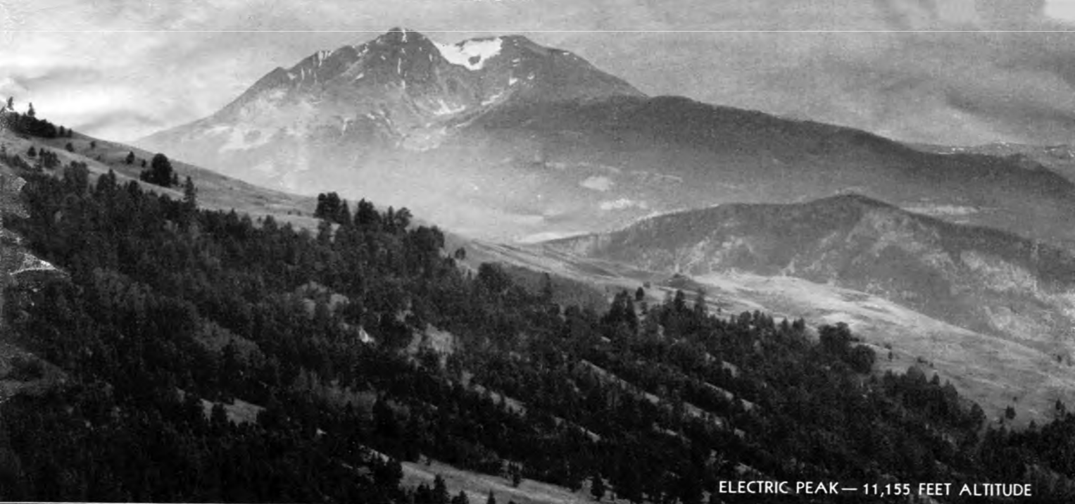
ELECTRIC PEAK — 11,155 FEET ALTITUDE