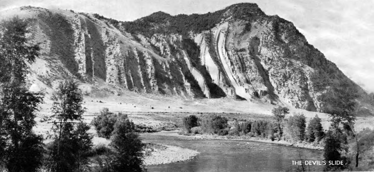
THE DEVIL'S SLIDE