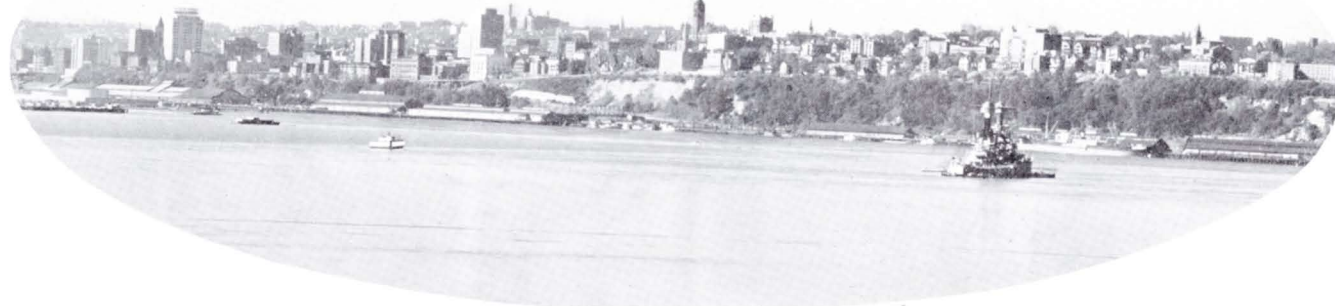
The Tacoma Skyline, from Commencement Bay