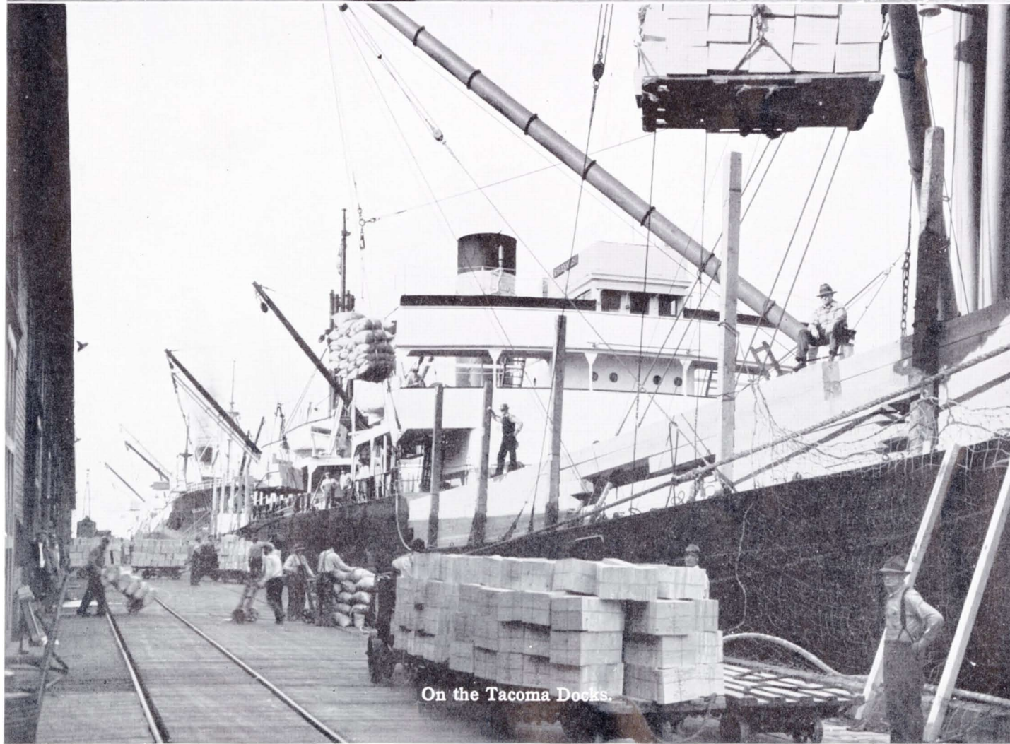
On the Tacoma Docks.