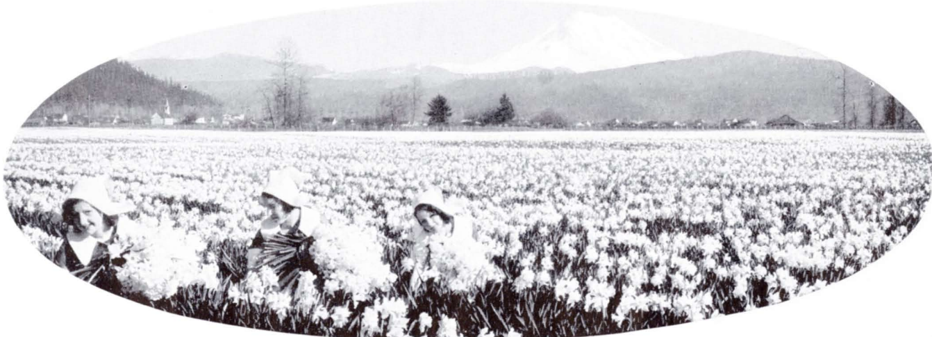
Daffodil Fields in Puyallup Valley near Tacoma—The Mountain in the Background.

the downtown district, you can be trolling for salmon off Point Defiance.