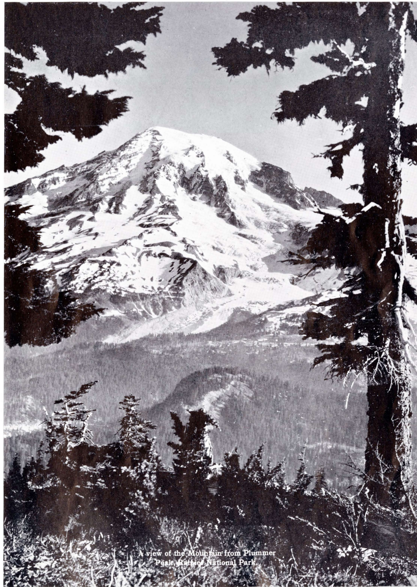
A view of the Mountain from Plummer Peak, Rainier National Park.