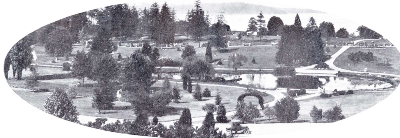
Point Defiance Park, with Puget Sound in Background

steamship companies operate to and from Tacoma's harbor.