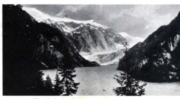
The Alaska Line's ocean trail through mountains