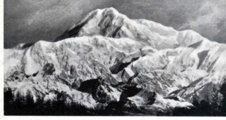
Majestic Mt. McKinley, reached by The Alaska Railroad

Your nearest railroad agent, shown herein, in conjunction with the Alaska Steamship Company, will gladly prepare special itineraries for extended tours of Alaska not included in the regular schedules, or for big game hunting and fishing expedi-tions into the less traveled parts of the Territory.