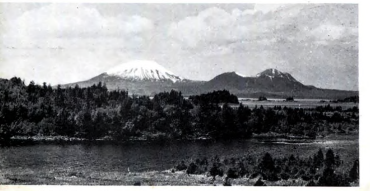
Mt. Edgecumbe, replica of Fujiyama, rises near Sitka