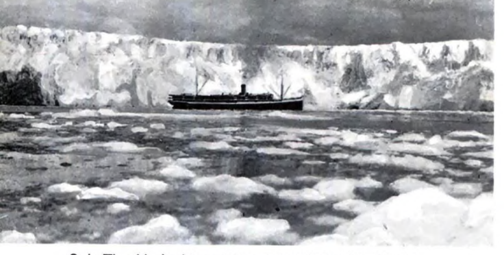
Only The Alaska Line visits mighty Columbia Glacier