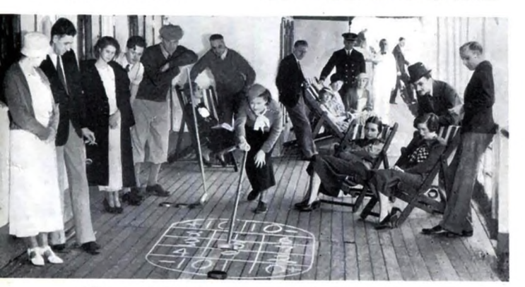
Congenial shipmates gather on The Alaska Line