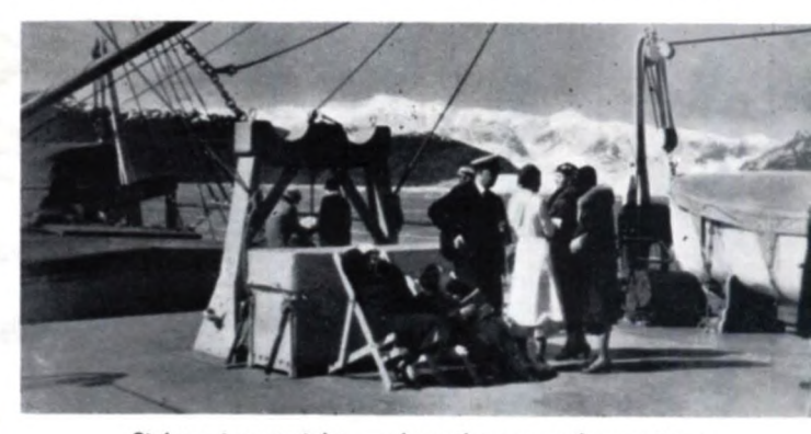
Sightseeing at night — where the sun works overtime