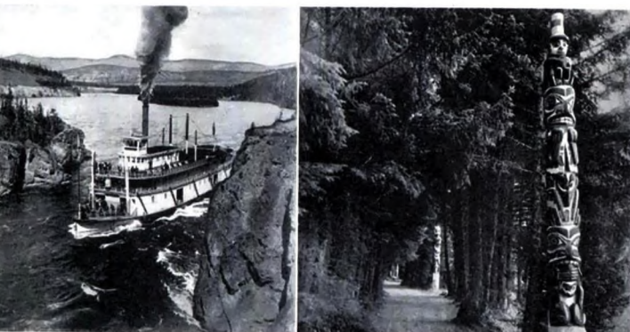
Totem-lined Lovers' Lane, at Sitka