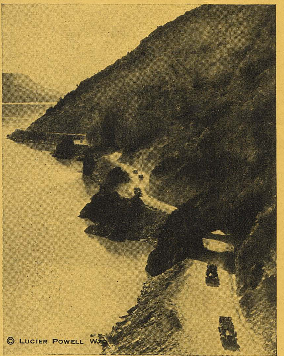
The Thrilling Cody Road to Yellowstone

Apollinaris Spring and Iron Spring are worth tasting. You are not dreaming—the Yellowstone wonders are