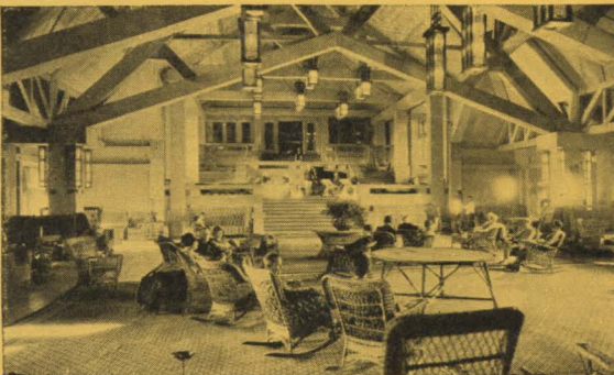
Lobby, Grand Canyon Hotel