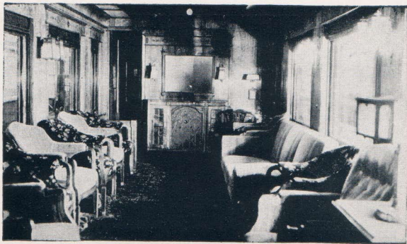
General Lounge, Observation Car