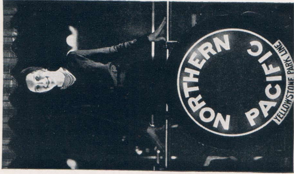
A Broad Sightseeing Platform