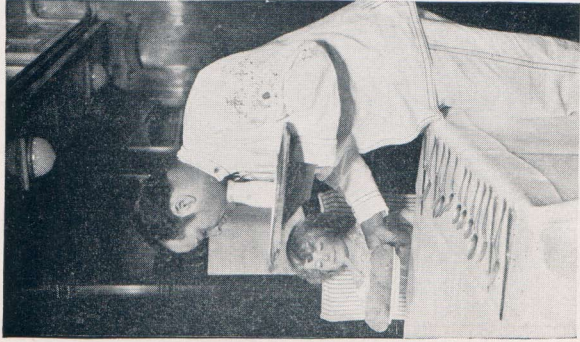
The "Brand New" Diners of course serve Big Baked Potatoes