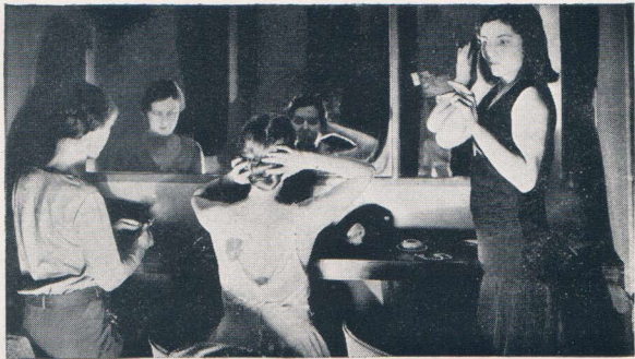
Extraordinarily Large Dressing Rooms