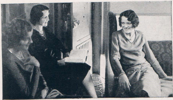
Private Rooms En Suite