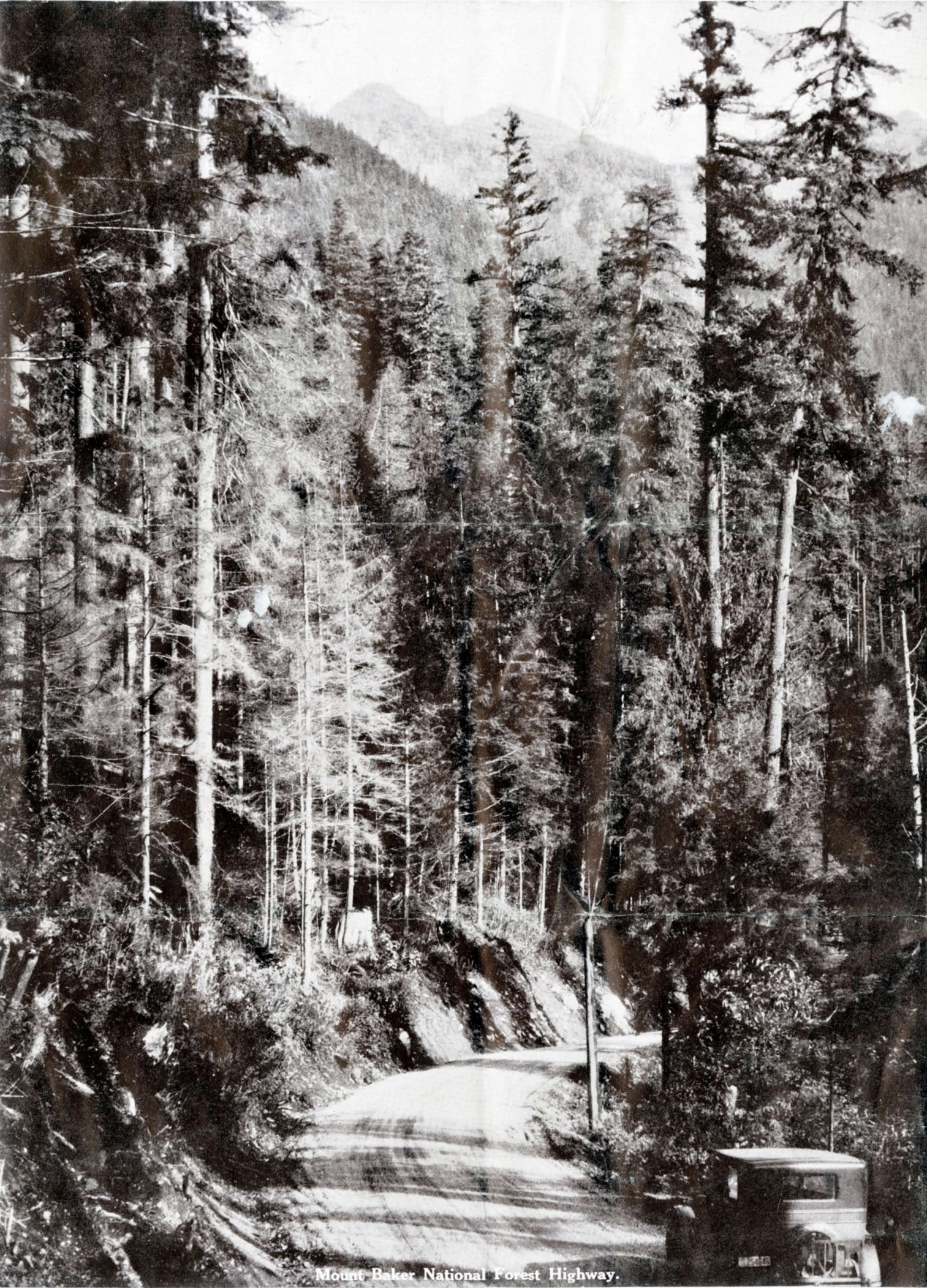
Mount Baker National Forest Highway.