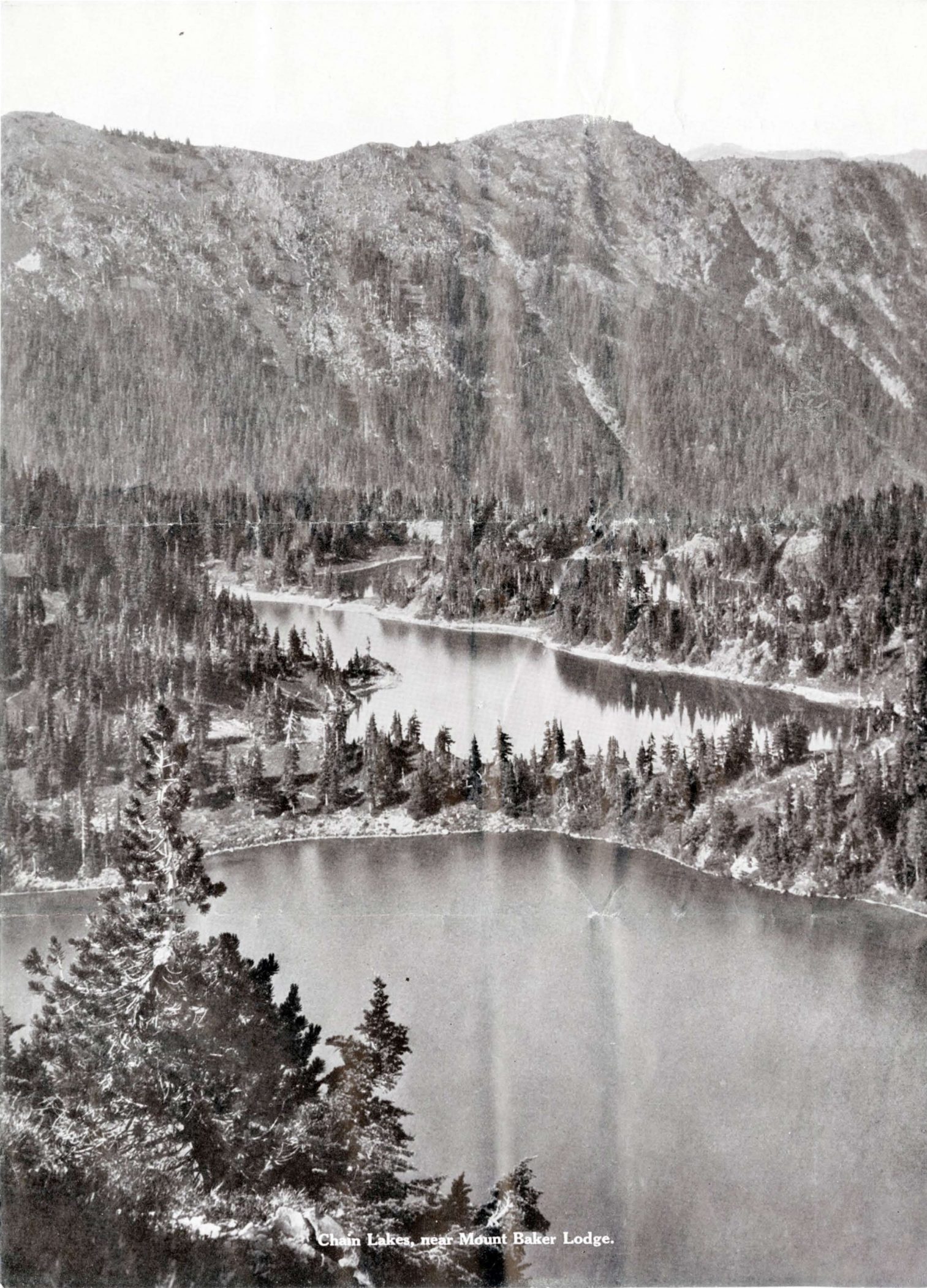
Chain Lakes, near Mount Baker Lodge.