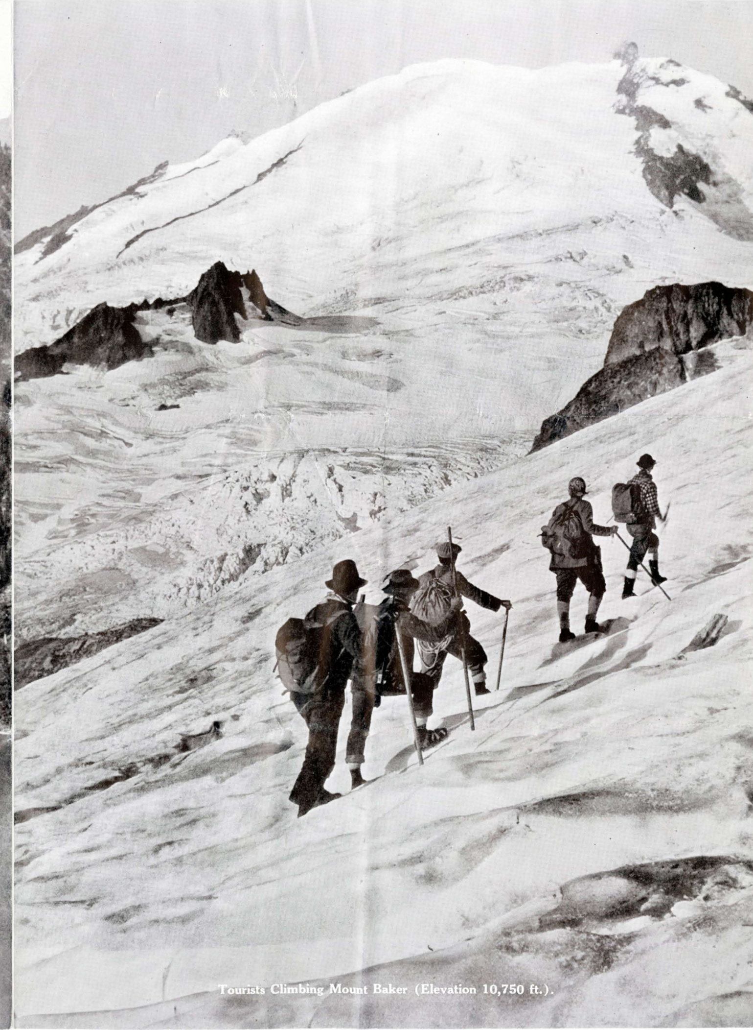
Tourists Climbing Mount Baker (Elevation 10,750 ft.).