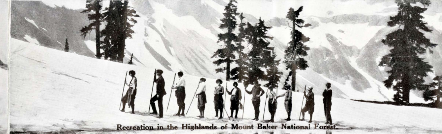
Recreation in the Highlands of Mount Baker National Forest.