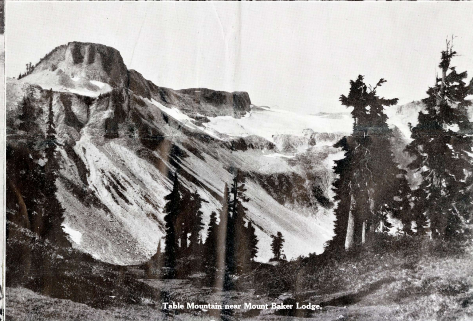
Table Mountain near Mount Baker Lodge.