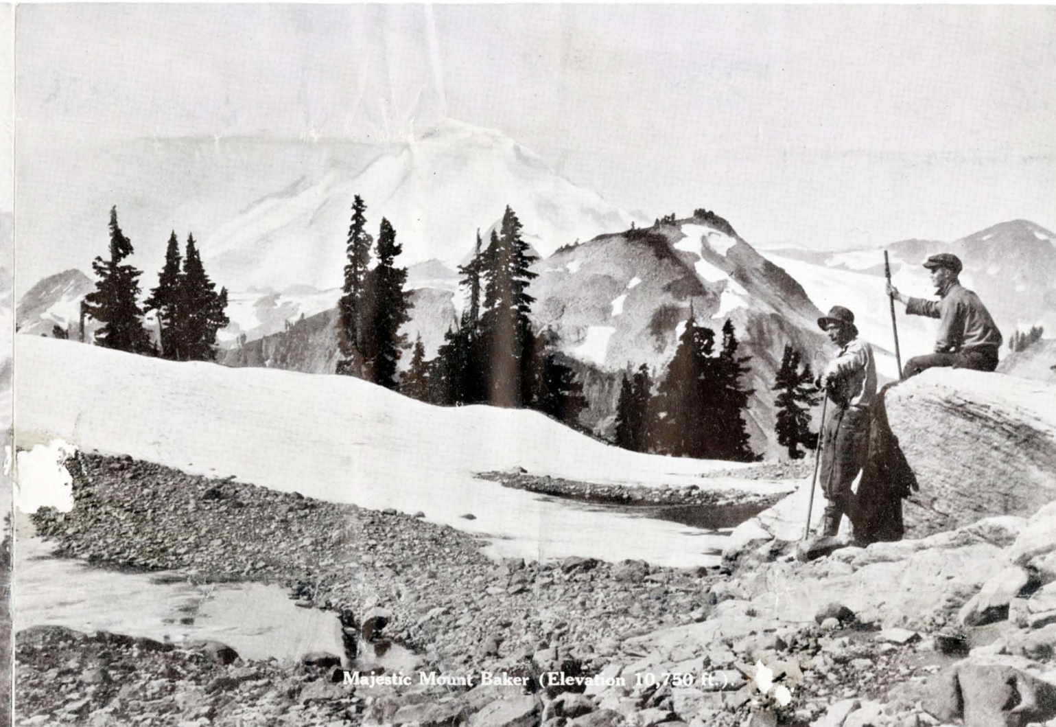
Majestic Mount Baker (Elevation 10,730 ft.)