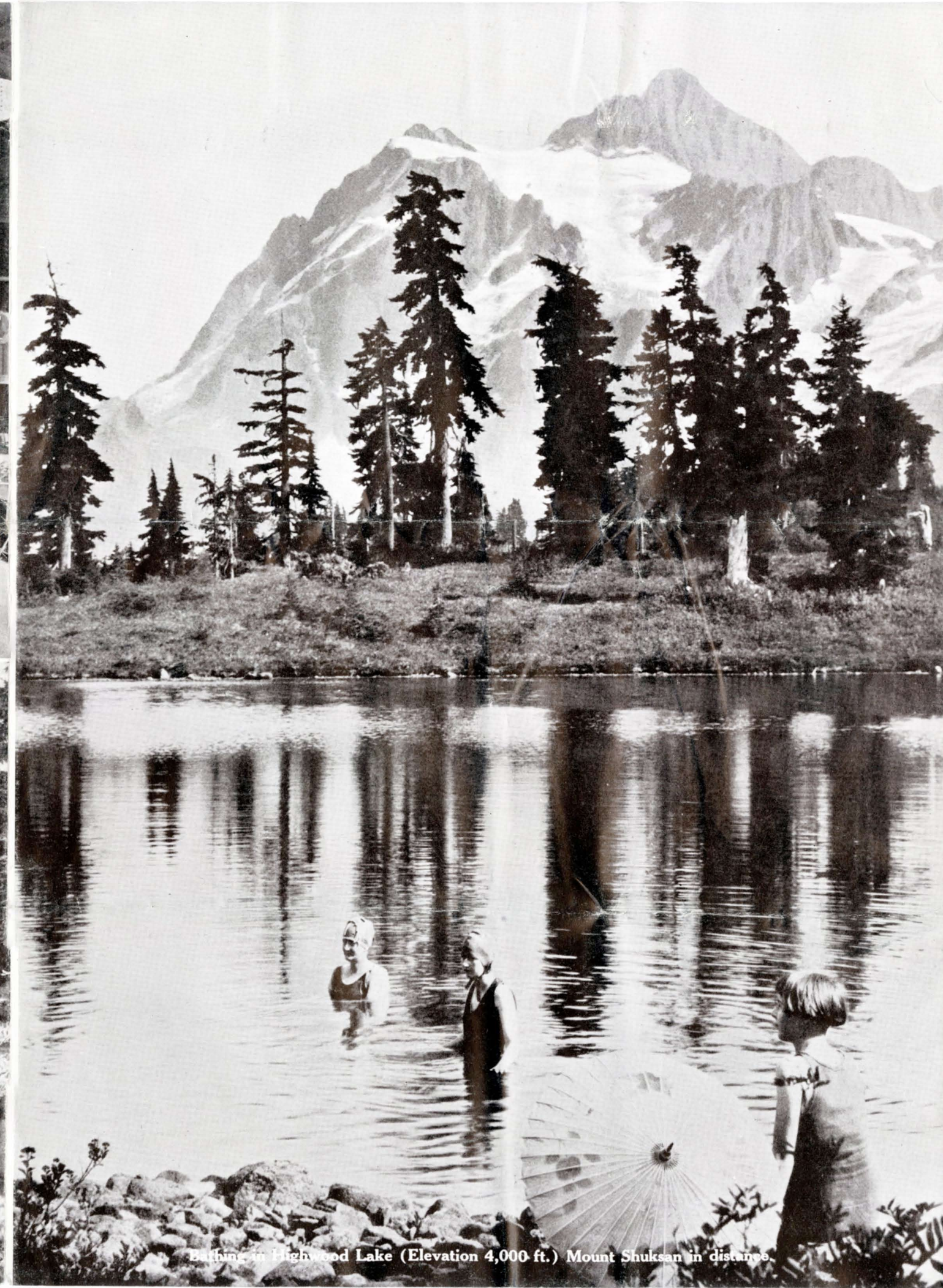
Bathing in Highland Lake (Elevation 4,000 ft.) Mount Shuksan in distance.