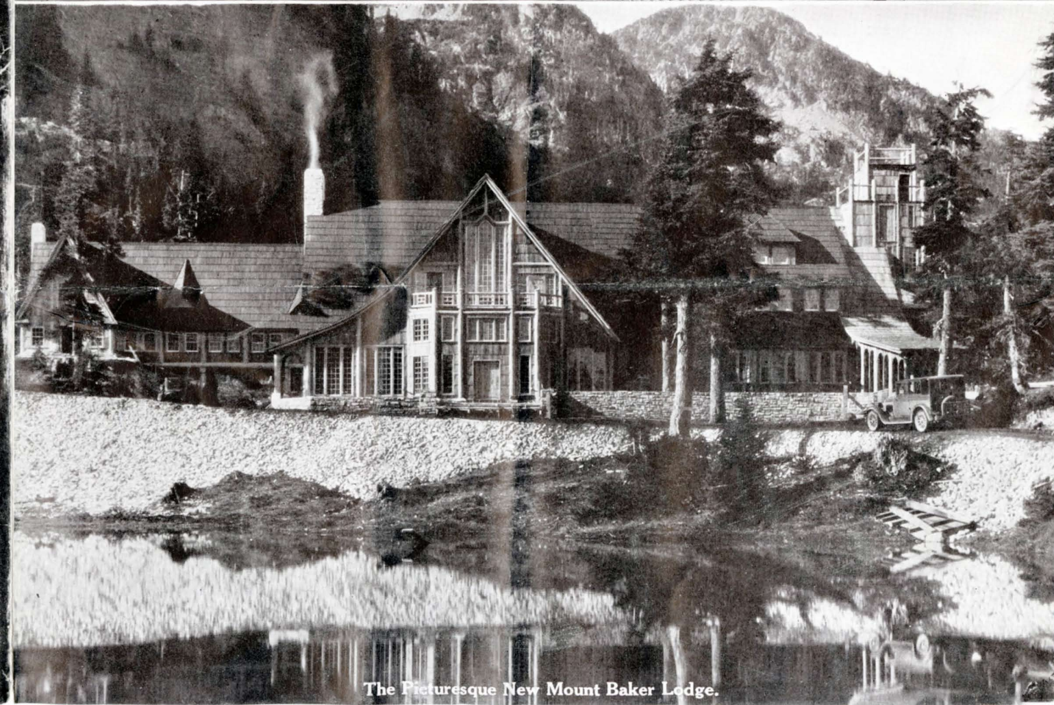
The Picturesque New Mount Baker Lodge.