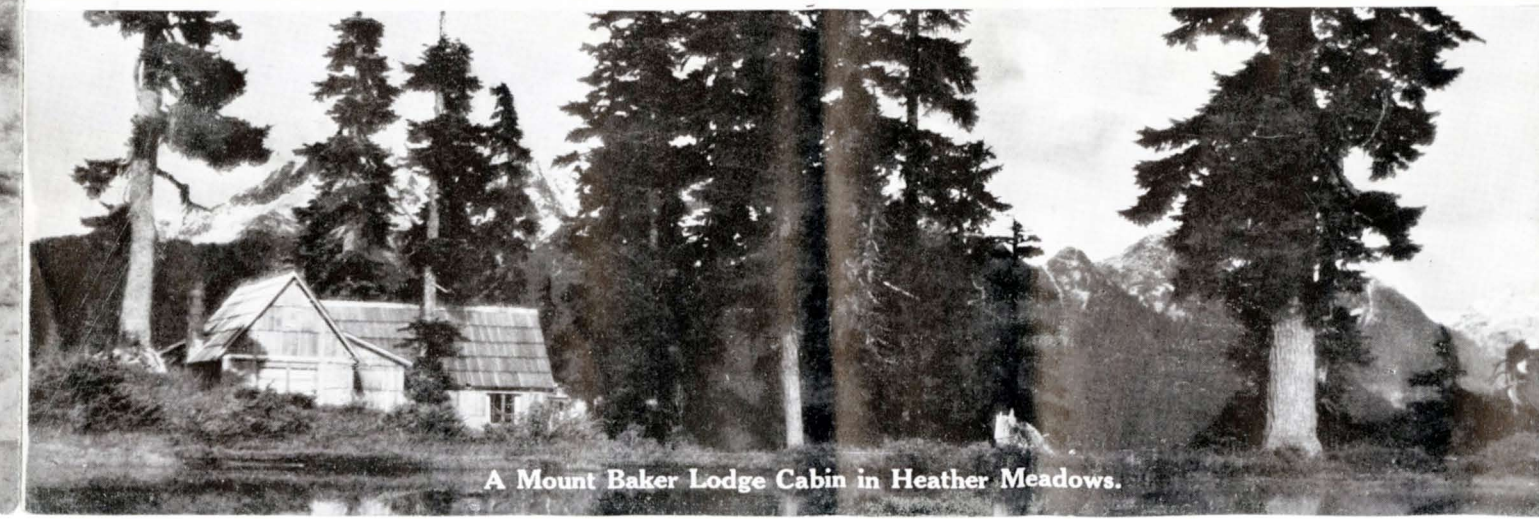
A Mount Baker Lodge Cabin in Heather Meadows.