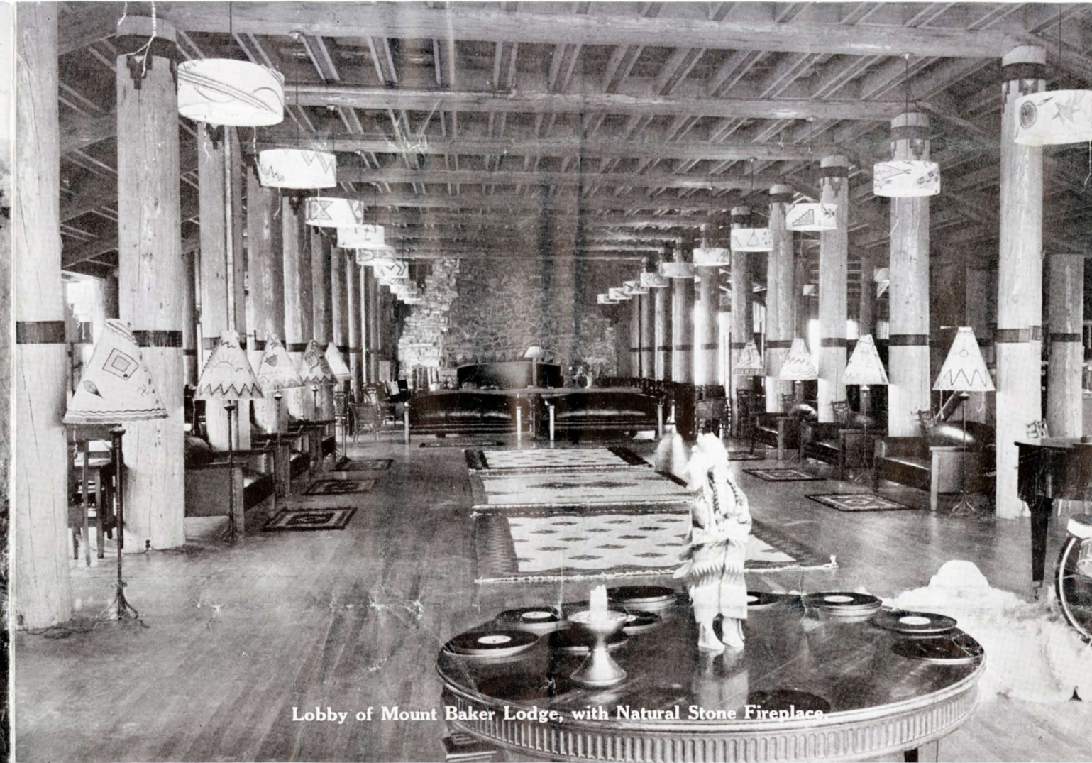
Lobby of Mount Baker Lodge, with Natural Stone Fireplace.