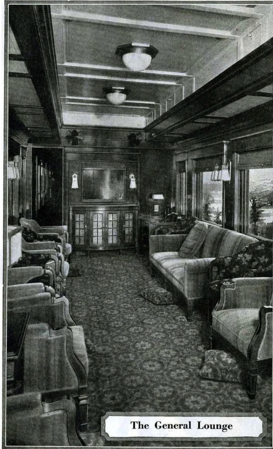
The General Lounge