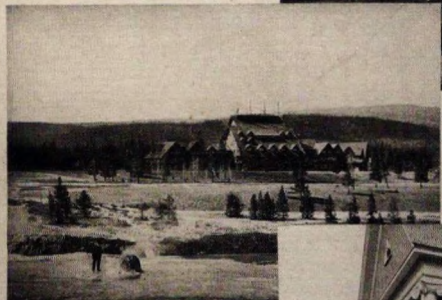
OLD FAITHFUL INN