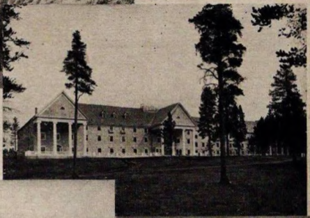
LAKE COLONIAL HOTEL