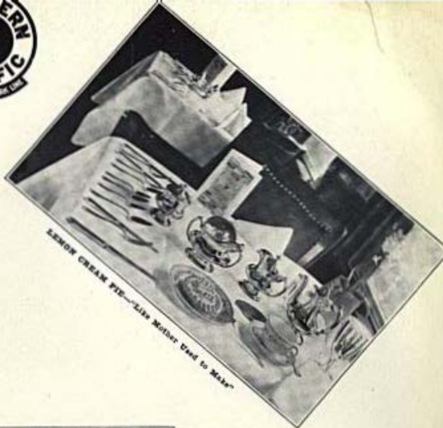
LEMON CREAM PIE—“Like Mother Used to Make”