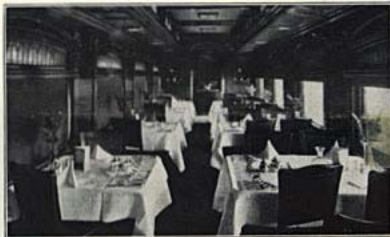
DINING CAR—Unexcelled in Beauty