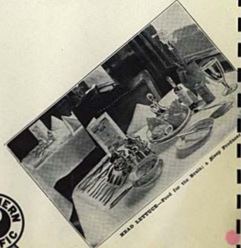
HEAD LETTUCE—Food for the Birds! a Sharp Product