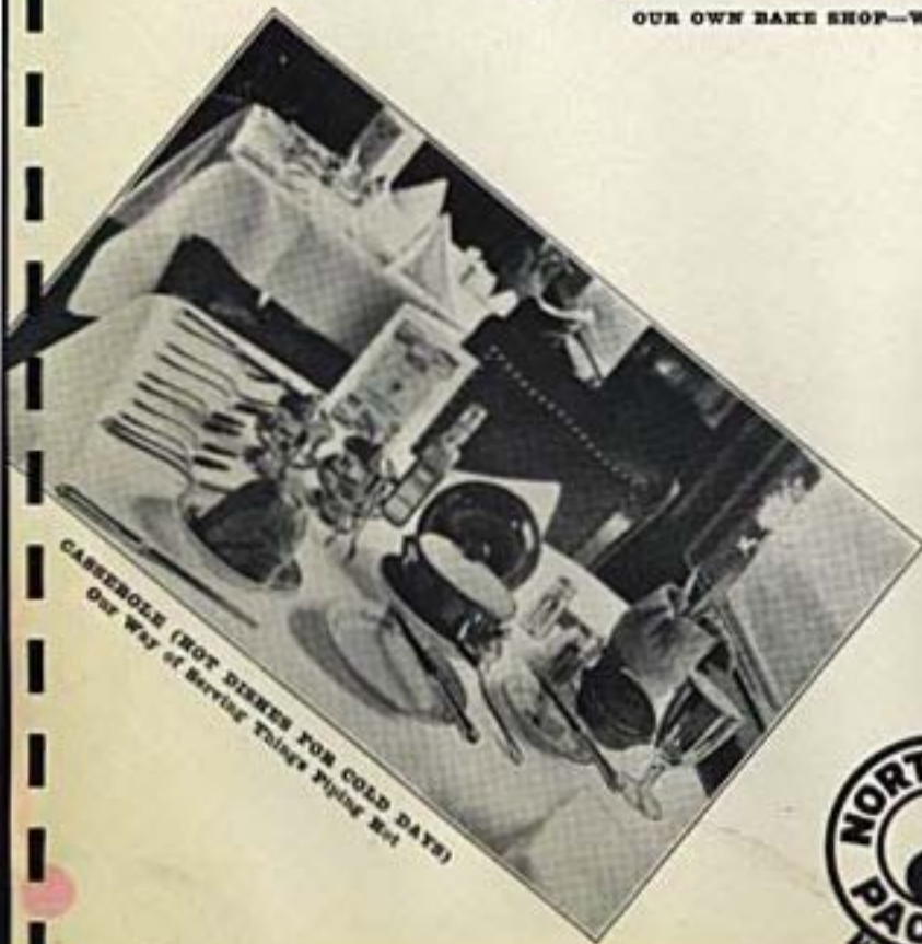
CASSEROLES (NOT DISKES FOR COLD DAYS) Our Way of Serving Today's Piping Hot