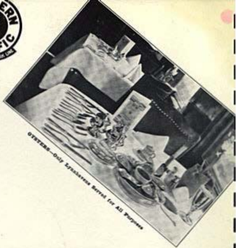
OYSTERS—Only Ketchikan Served for All Purposes