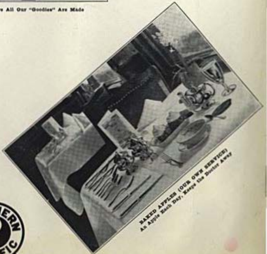
BAKED APPLES (OUR OWN SERVICE) An Apple Each Day, Keeps the Doctor Away