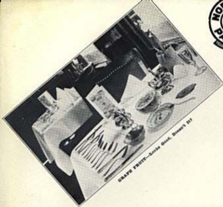
GRAPE FRUIT—Looks Good, Doesn't It?