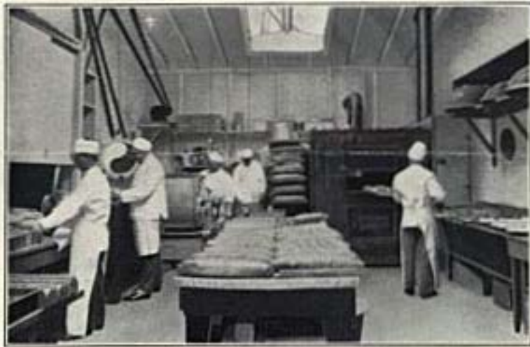
OUR OWN BAKE SHOP—Where All Our “Goodies” Are Made