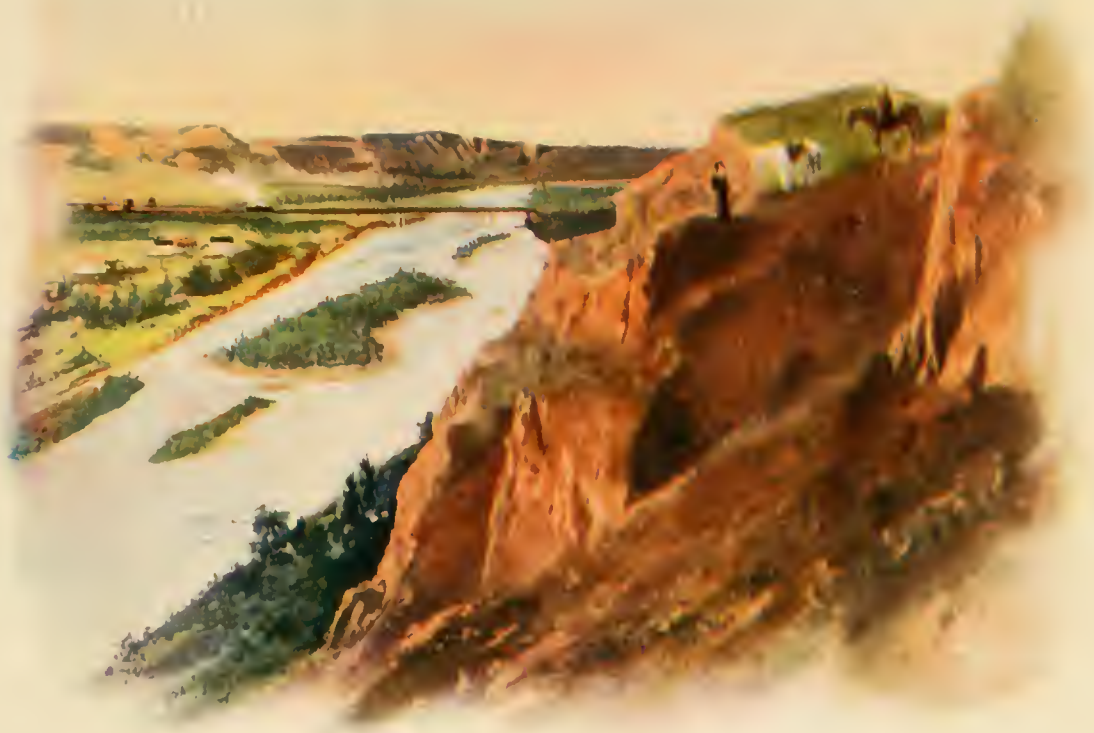
In the "Bad Lands"