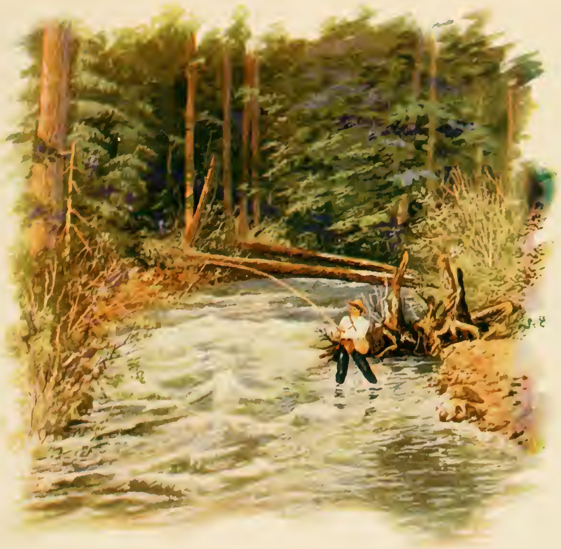
The Home of the Rainbow Trout