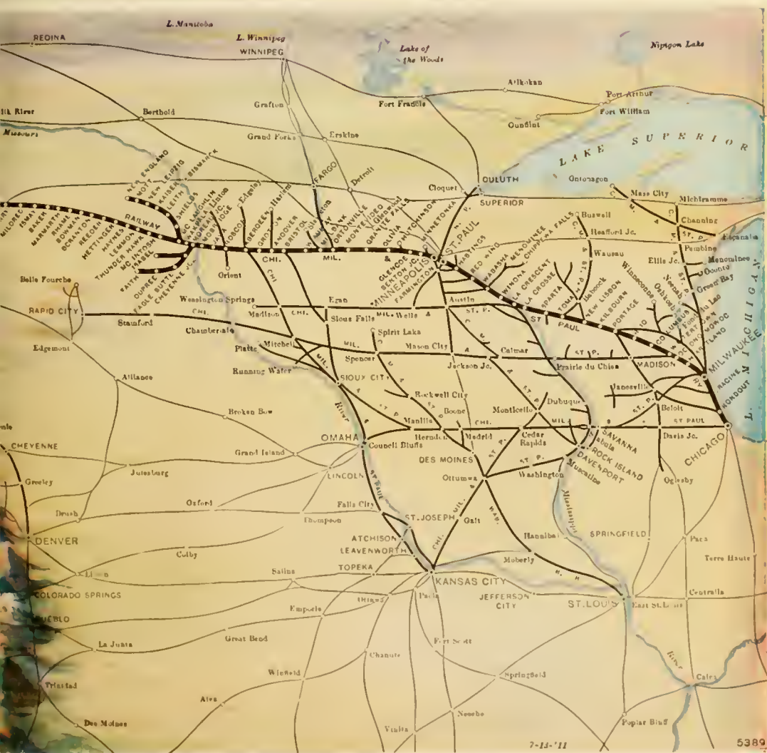
Puget Sound Railway and Connections