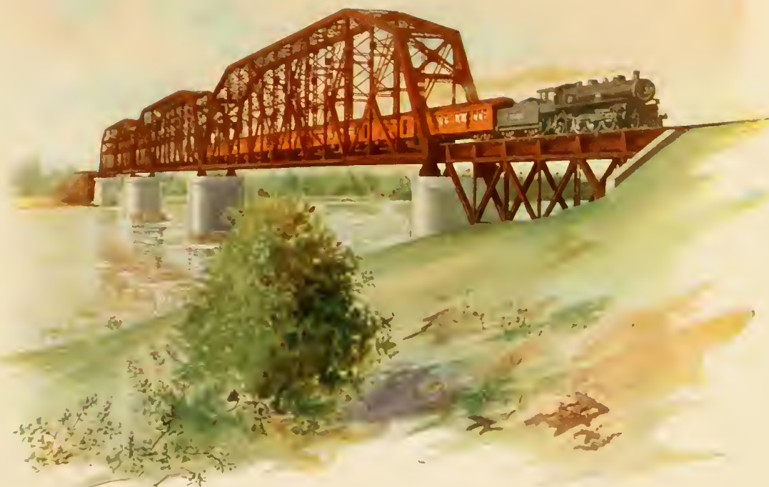
The Missouri River Bridge