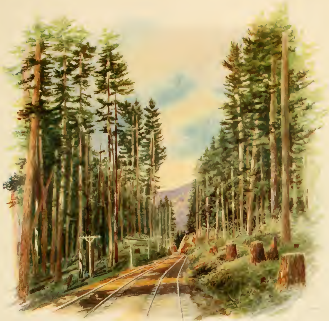
Washington Firs—Tacoma Eastern Railway