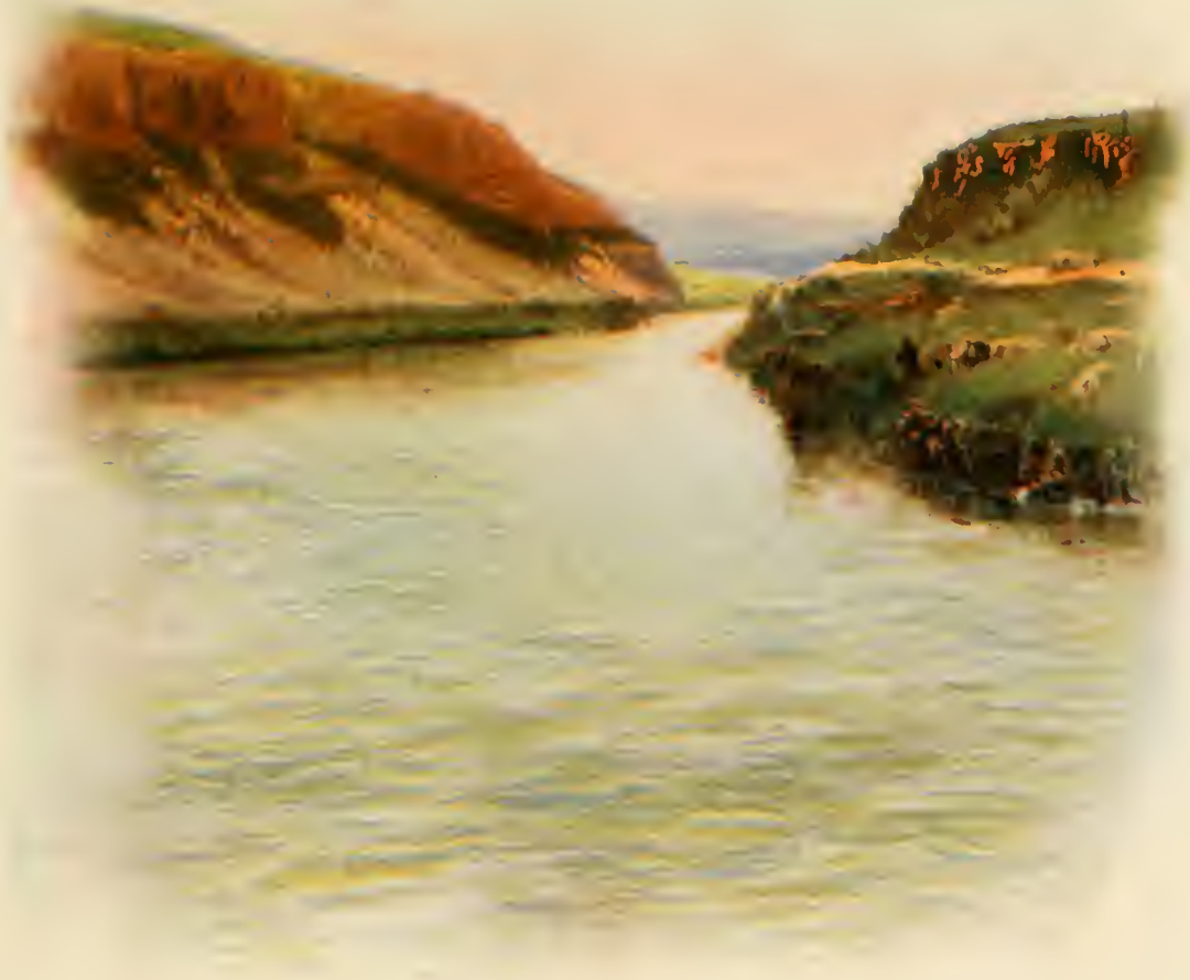
Near the Headwaters of the Missouri