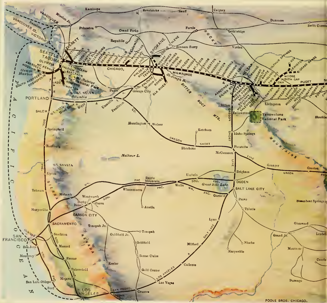
"Across the Continent"—Map of the Chicago, Milwaukee