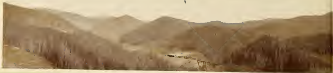
In the Heart of the