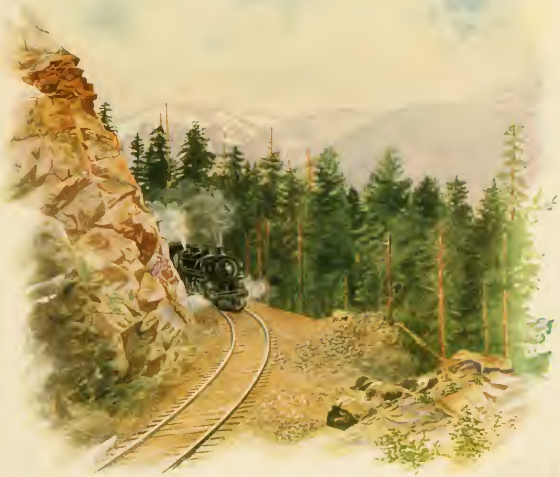
In the Cascade Mountains