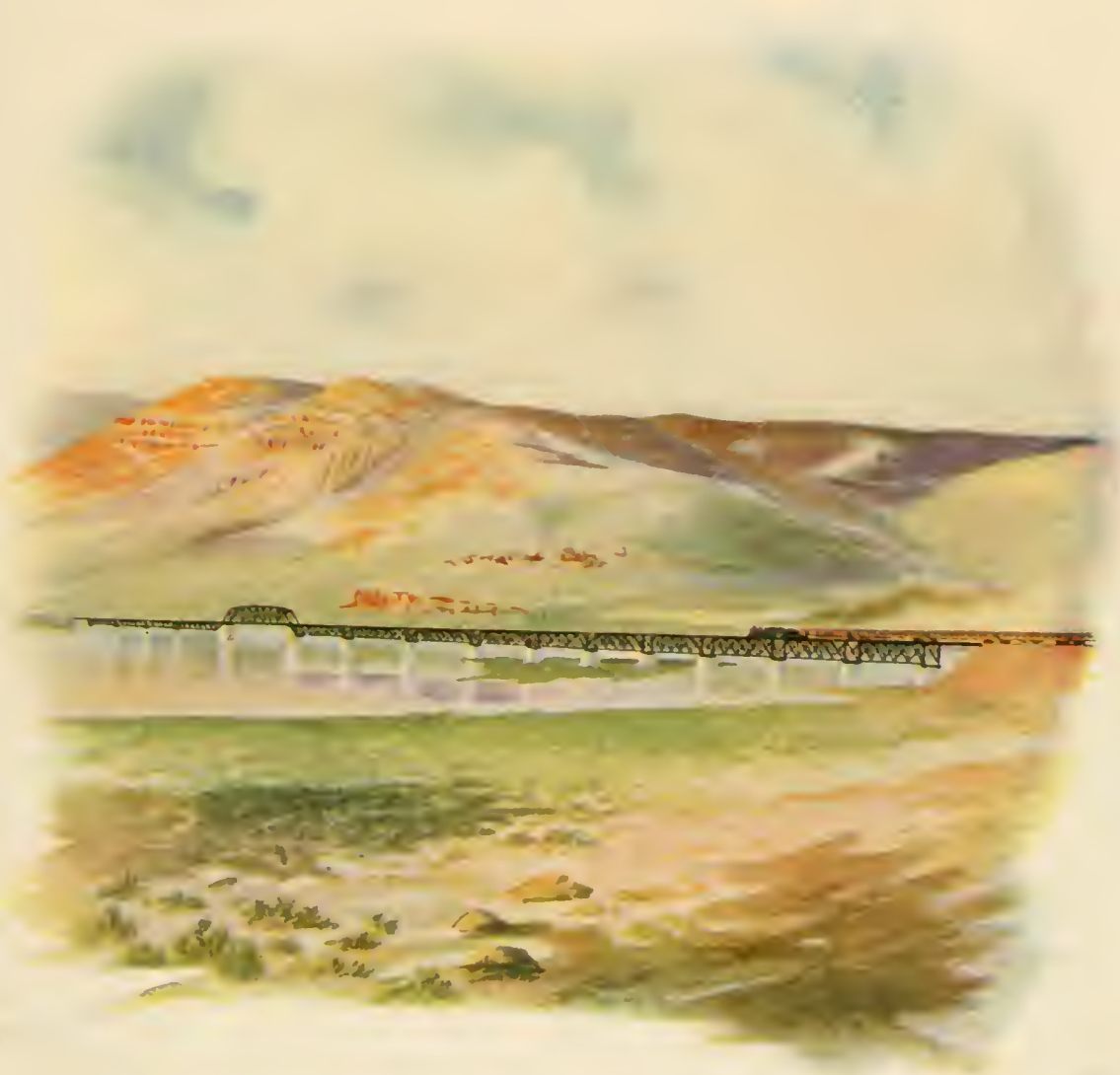
The Columbia River Bridge