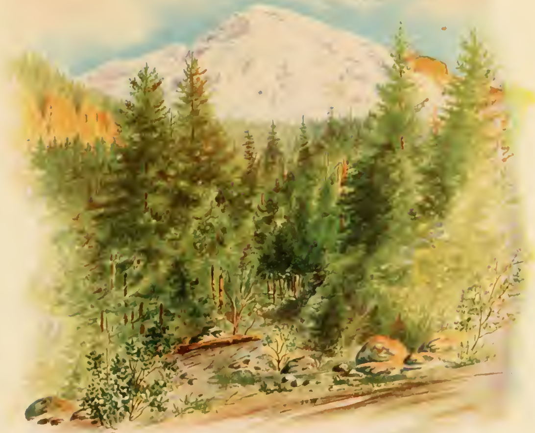
The Silent Sentinel of Puget Sound