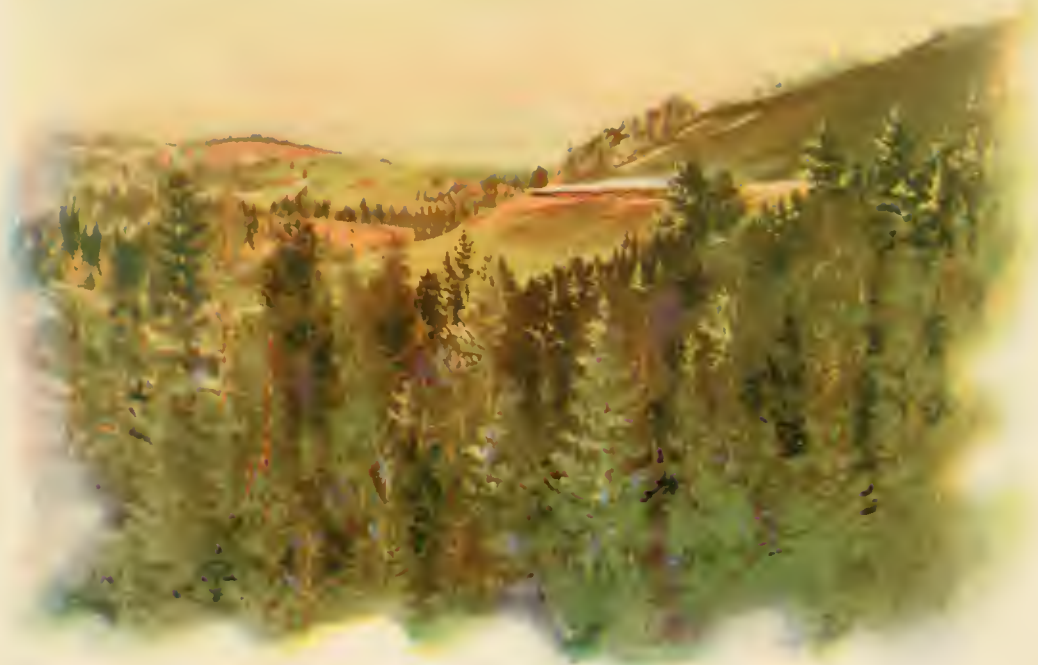
The Crest of the Continent