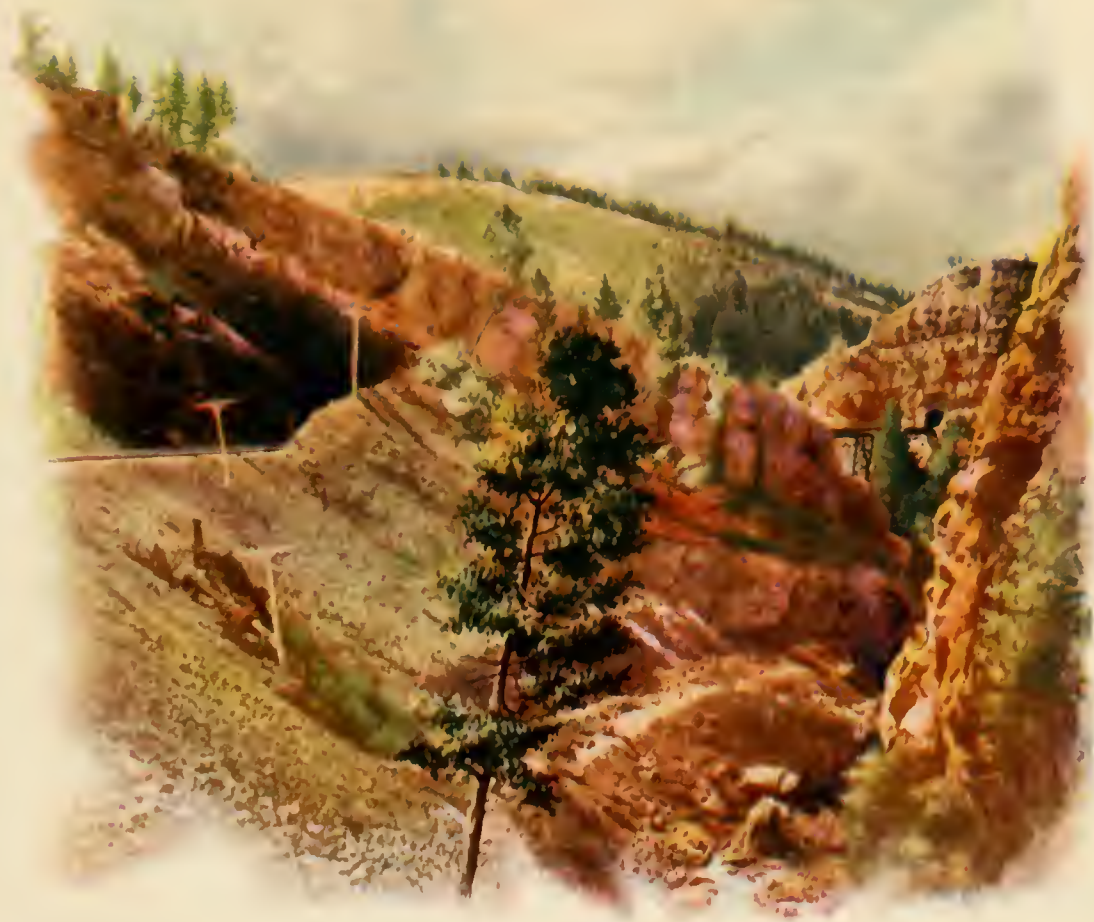
Two Tunnels and a Bridge, Montana Canyon