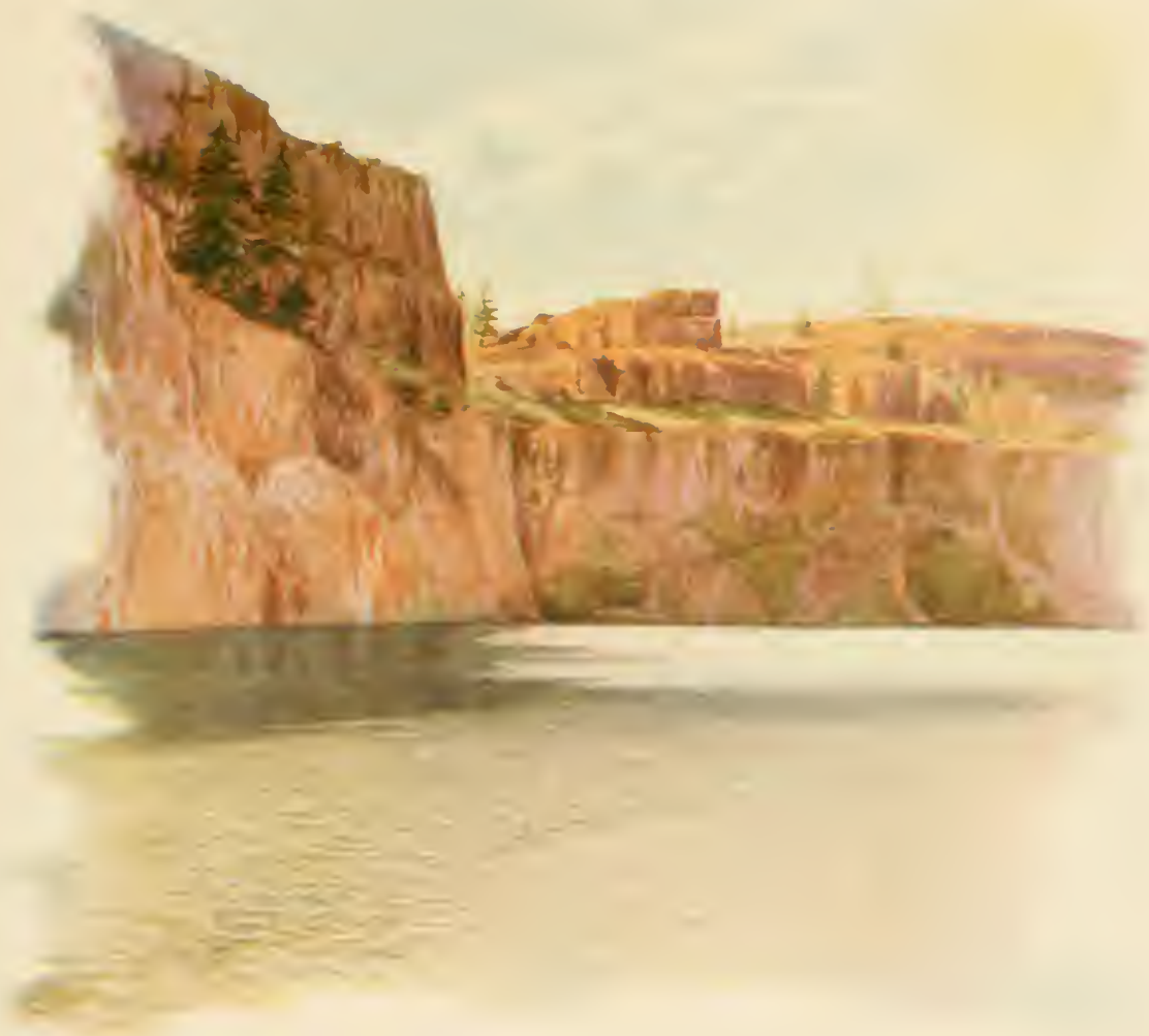
The "Lake of Mystery"—Rock Lake