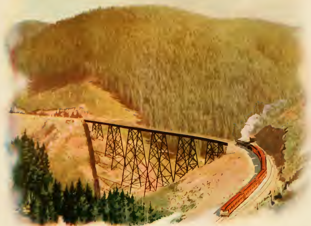
Clear Creek Viaduct—Bitter Root Mountains