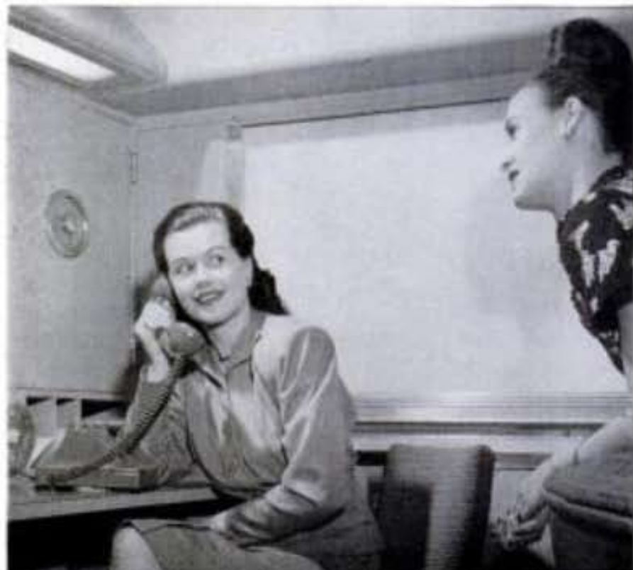
RADIO-TELEPHONE enables passengers to call home from speeding train. Demonstration guests called Queen Elizabeth at sea, talked with the captain.