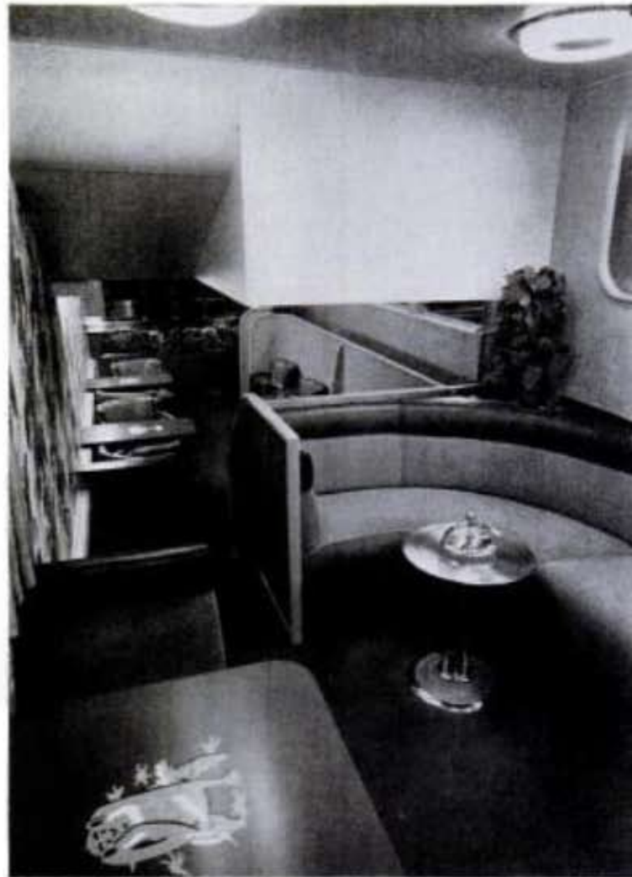
COCKTAIL LOUNGES are built into observation car at two levels (above). Bar is in background beneath dome. Decor is green, ivory, turquoise, peach.