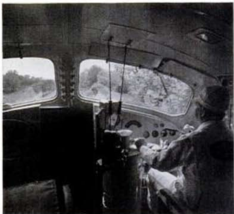
LOCOMOTIVE is 2,000-hp diesel, runs 100 mph. Rigid couplings between passenger cars enable engineer to start and stop the train without usual jerk.