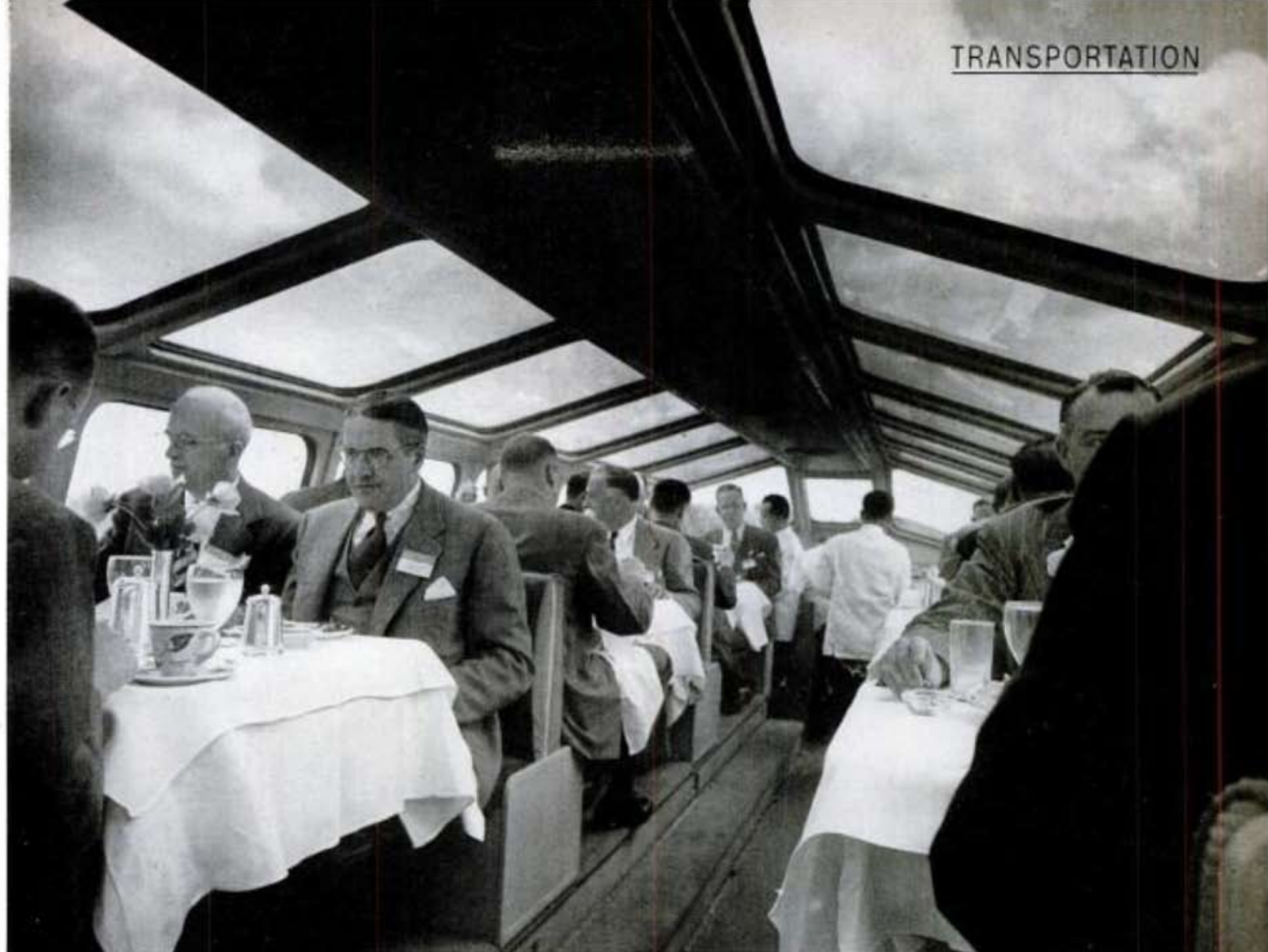
ON A DEMONSTRATION RUN OF THE NEW G.M. TRAIN PASSENGERS DINE IN THE "ASTRA DOME" 15½ FEET ABOVE RAILS. TWO MORE DINING ROOMS ARE DOWNSTAIRS