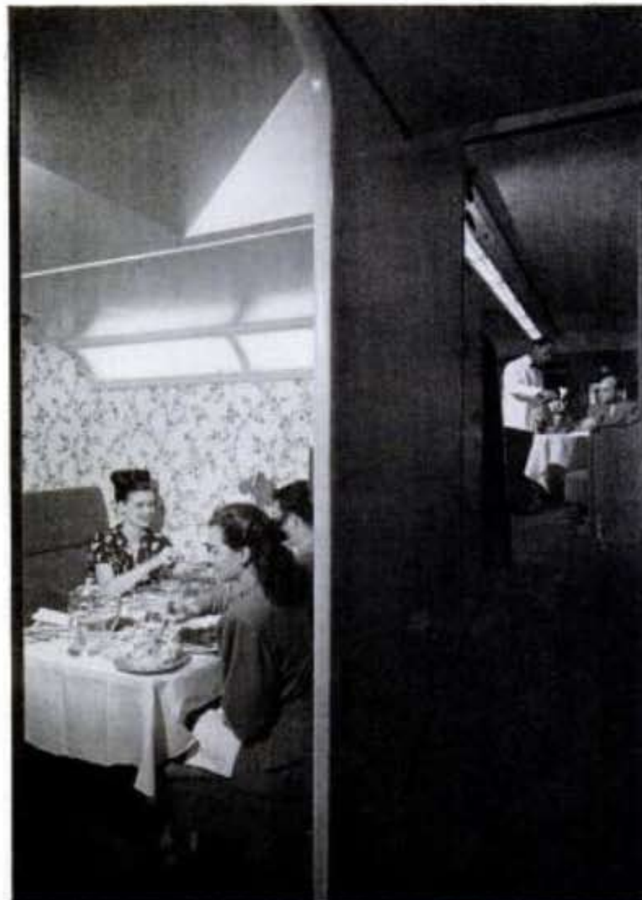
PRIVATE DINING ROOM (left) is sunken compartment, lowest of dining car's four levels. Main room is at right. Each car has separate diesel power unit.