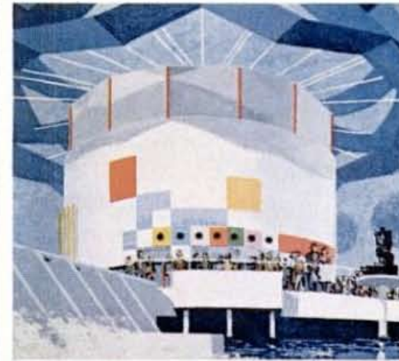
World of commerce and industry

World of Century 21 creates an environment of the future... gives you ingenious insight into the way man will live, work and play in tomorrow's Space Age. Glass walls enclose three levels of exhibits... provide relaxed, unobstructed viewing. Site of project is Coliseum Century 21, Washington State's $7,500,000 theme building—an architectural miracle.