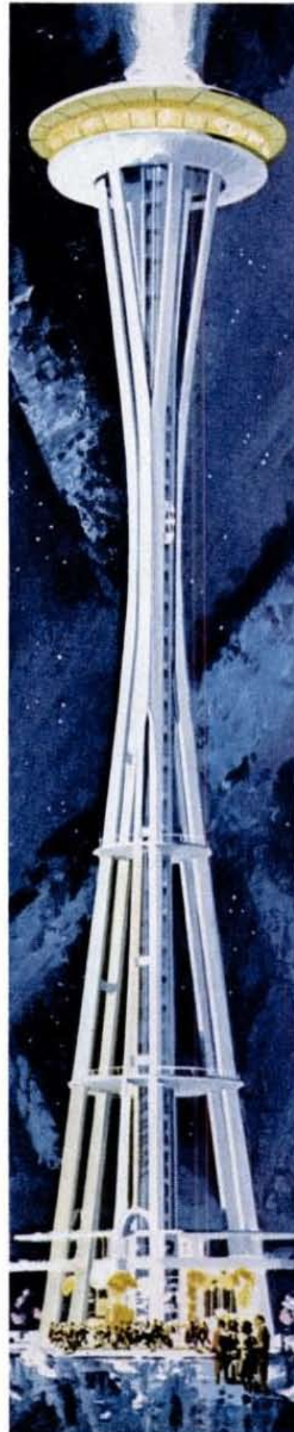
600-foot Space Needle