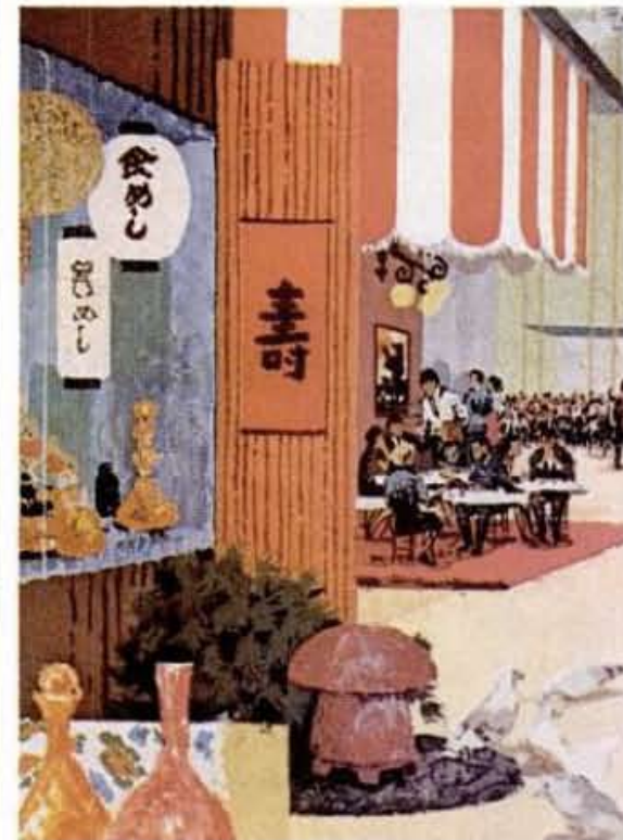
Boulevards of the World

World of Century 21 creates an environment of the future... gives you ingenious insight into the way man will live, work and play in tomorrow's Space Age. Glass walls enclose three levels of exhibits... provide relaxed, unobstructed viewing. Site of project is Coliseum Century 21, Washington State's $7,500,000 theme building—an architectural miracle.