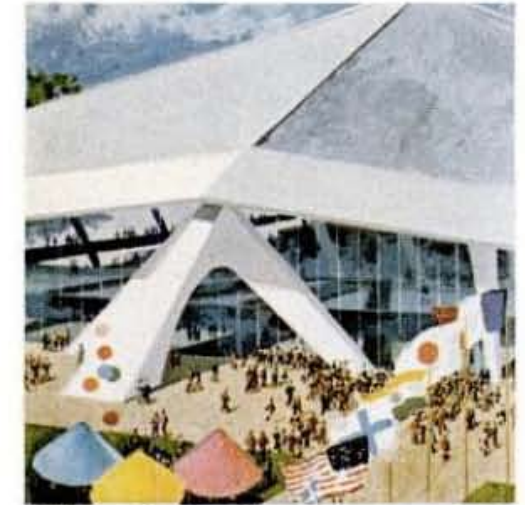
Coliseum Century 21

dance and musical troupes, sports events. See exhilarating evidence of how today's most advanced thinking in architecture, design and technology will provide tomorrow's everyday living.