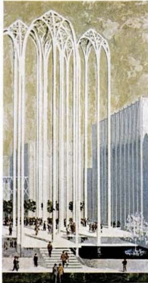
U.S. Science Pavilion

World of Science unfolds dynamic examples of man's continuing quest and application of knowledge from the universe. Featured fare in this most extensive science exhibit ever assembled is a simulated space journey through the solar system and beyond.