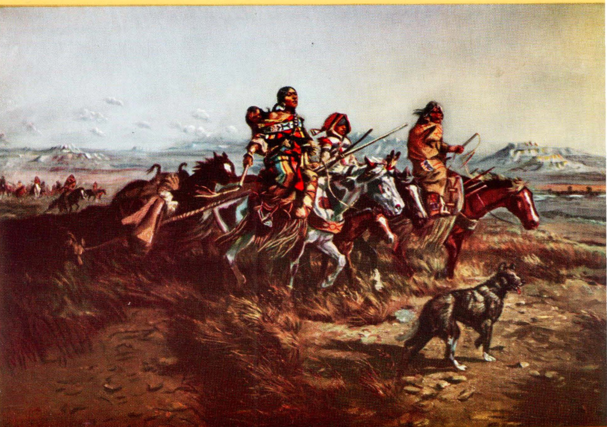
INDIAN WOMEN MOVING