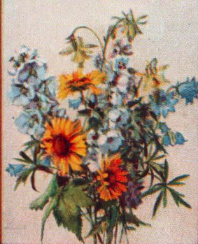
GLACIER NATIONAL PARK WILDFLOWERS