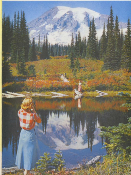
MT. RAINIER'S snow-mantled peak is mirrored in a mountain pool, framed by the colors of autumn.