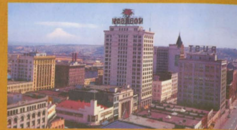
MODERN TACOMA , lumber and shipping center south of Seattle. Gateway to famed Mt. Rainier.