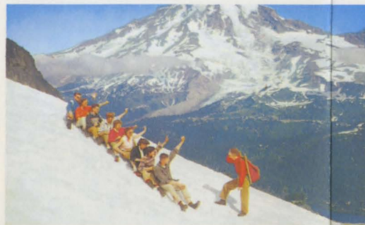
SLIDING ON "TIN PANTS" Visitors enjoy this unique experience and a wide variety of snow-sports on the gentle slopes of Mt. Rainier.