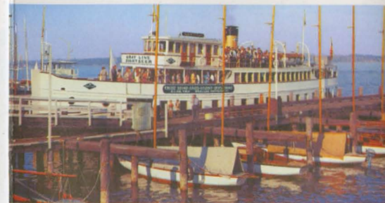
SIGHTSEEING SHIPS tour fresh-water Lake Washington, through canals and Government Locks to salt-water Puget Sound.