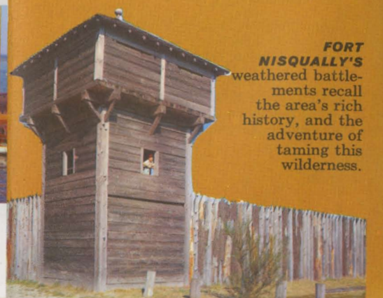
FORT NISQUALLY'S weathered battlements recall the area's rich history, and the adventure of taming this wilderness.