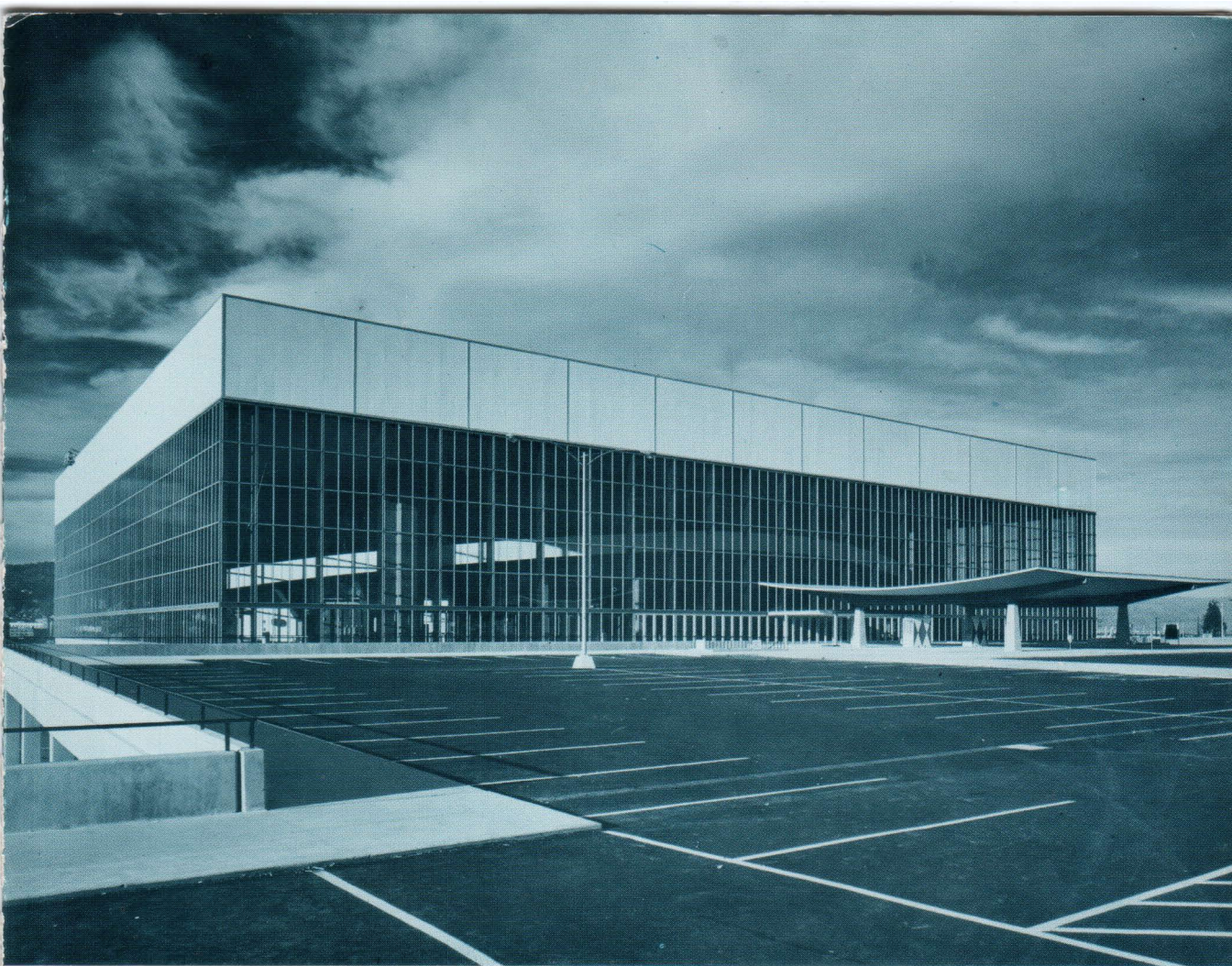
The dramatic Memorial Coliseum is an inspiring and breath-taking addition to Portland's skyline.