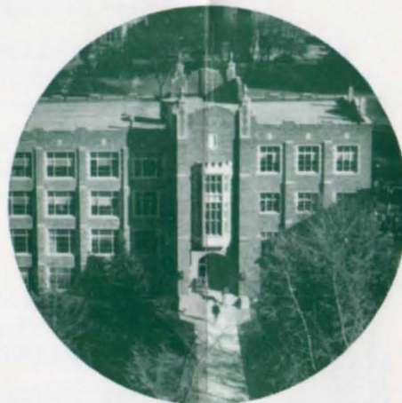
THE UNIVERSITY OF NORTH DAKOTA is located at Grand Forks. The city lies in the heart of the famous Red River Valley.