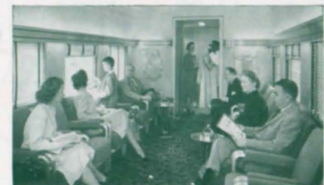
LOUNGING'S GREAT and traveling's fun in the parlor-observation lounge. Visit, read or sightsee as the valley slips past panoramic windows.