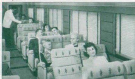
RELAXING'S GREAT in 'Sleepy Hollow' reclining seats. Individual seats are adjustable—upright for sight-seeing or tilted back for cat-naps.

It's a great vacationland, too—a land of 10,000 lakes and hundreds of resorts. From the Twin Cities to Grand Forks, it's 320 miles of world-wide importance—the Red River Valley of the North.