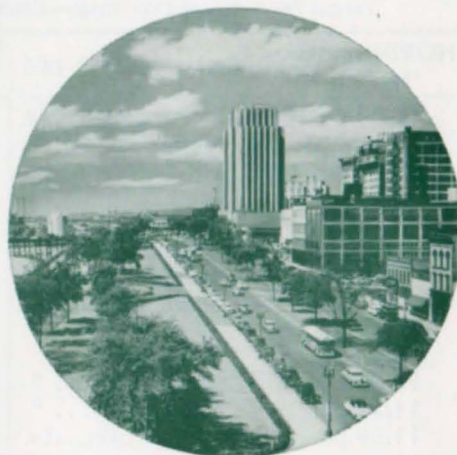
CAPITAL CITY of Minnesota, Saint Paul is a major distributing center for the Valley's vast and varied products.