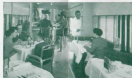
FOOD'S GREAT served Great Northern-style in the cozy dinette or coffee shop. Full table d'hote or a la carte meals. Beverages, in the parlor lounge!