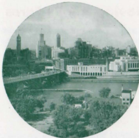
MUCH OF THE GOLDEN GRAIN from the Red River Valley is processed in Minneapolis, an important flour milling center.