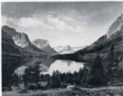
St. Mary Lake in Glacier National Park is acclaimed one of the most beautiful mountain lakes in the world.

by any of the Northern transcontinental rail routes. Although we're 5,215 feet above sea level, the mountains soar upward another two or three thousand feet on either side.