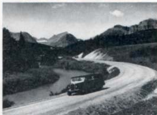
All hotels and many scenic areas in Glacier-Waterton Lakes National Parks are reached by motor-coach.