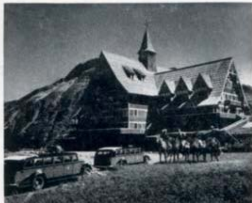
Prince of Wales Hotel, in adjoining Waterton Lakes National Park in Canada.

Turn to page 4 and chart tomorrow's trip