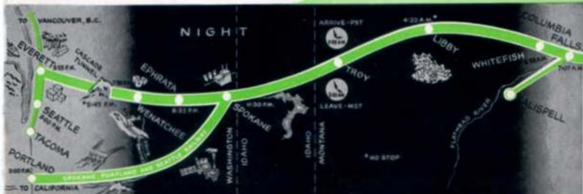
MAP No. 1

Chart today's daylight trip on pages 2 and 3