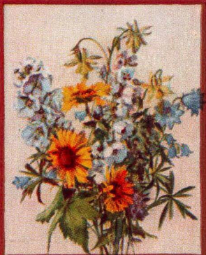
GLACIER NATIONAL PARK WILDFLOWERS

Please order by number and write your Employees are not permitted to serve