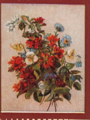
GLACIER NATIONAL PARK WILDFLOWERS

(Please write on meal check each menu item are not permitted to accept or serve orders)