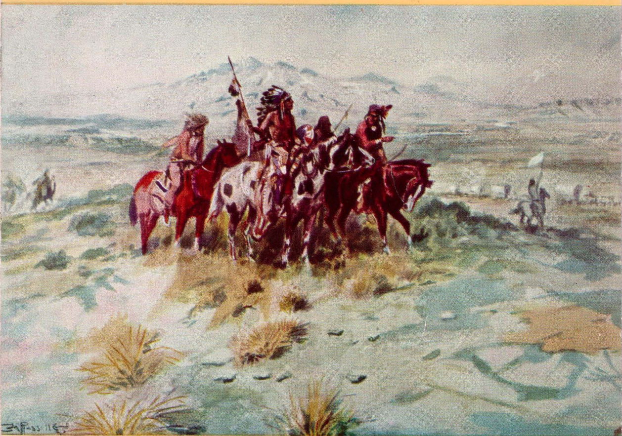
INTERCEPTED WAGON TRAIN