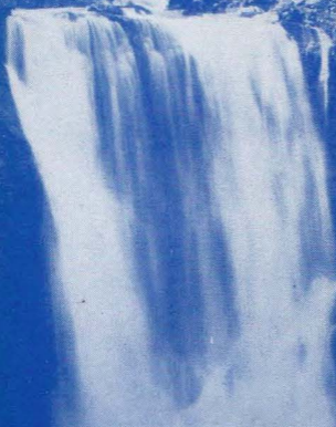
DAWN MIST FALLS