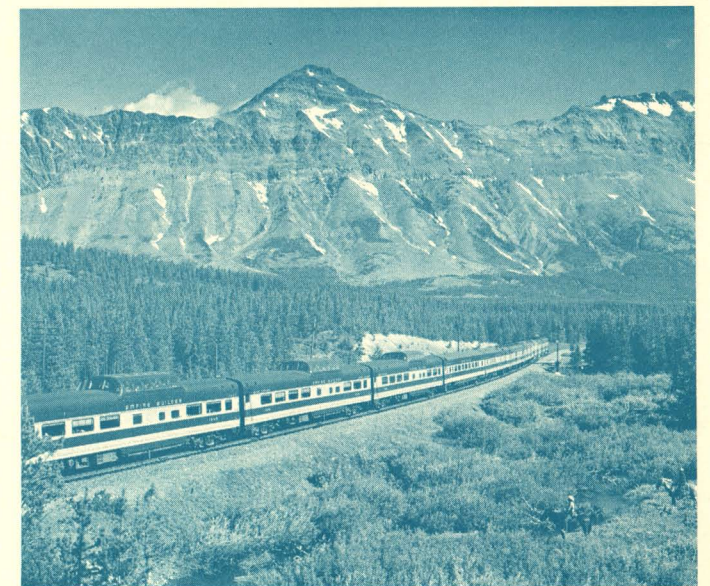
Incomparable Empire Builder enters Montana's Rockies

ASK YOUR NEAREST GREAT NORTHERN RAILWAY OR TRAVEL AGENT TO INCORPORATE YOUR SELECTION OF THESE FEATURES INTO A TAILOR-MADE ITINERARY