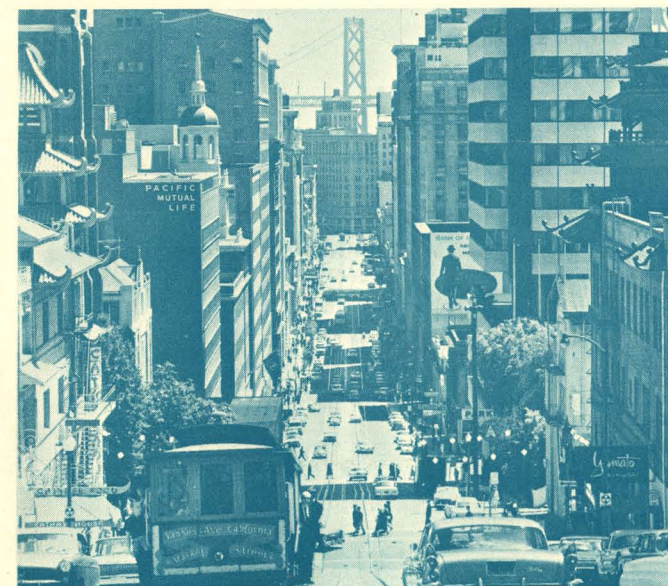
San Francisco's Wall Street with the Bay Bridge in the distance