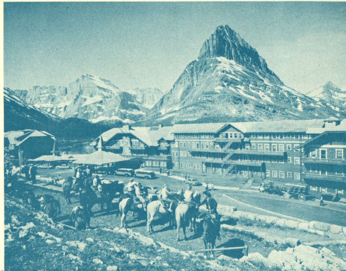
Many Glacier Hotel in the heart of Glacier National Park