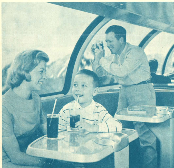
Picture-window views from 75 seats in the full-length Dome Car