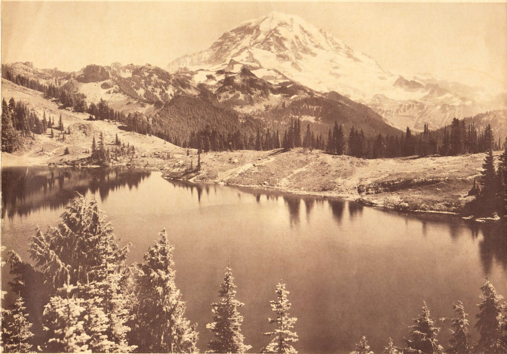
Mount Rainier — mighty monarch of the Cascades.

SUGGESTED SUMMER VACATION: Pre-arranged • Independent • Unescorted