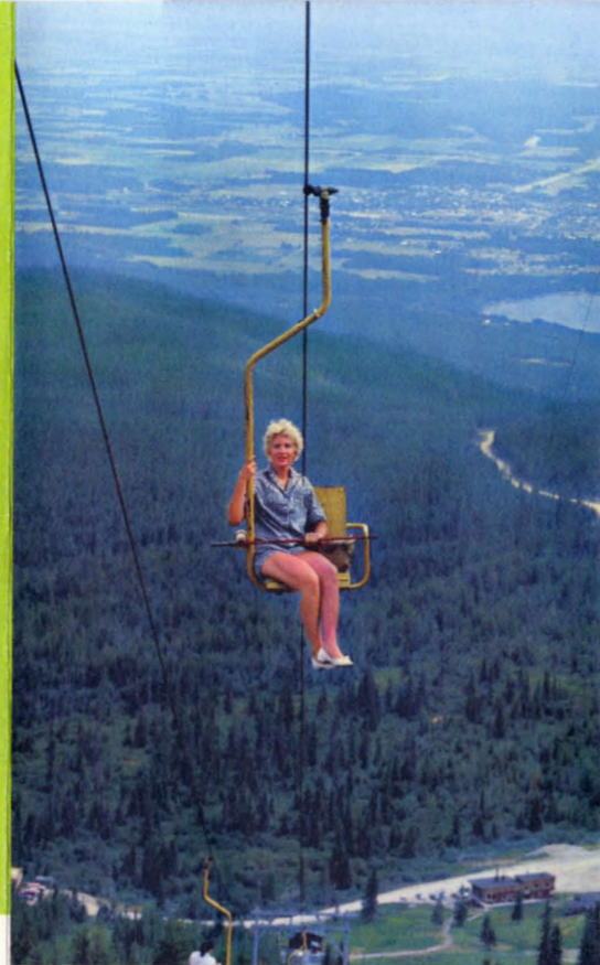
"Crow's nest" view of Rocky Mountain grandeur is provided at The Big Mountain. A new double chairlift rises 2,000 feet above valley near Whitefish.