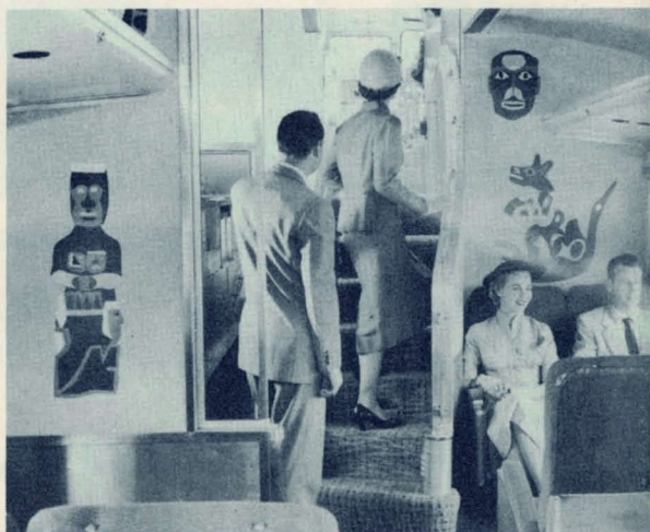
Stairway to the scenic thrills of the West! and look at those Indian decorative motifs!