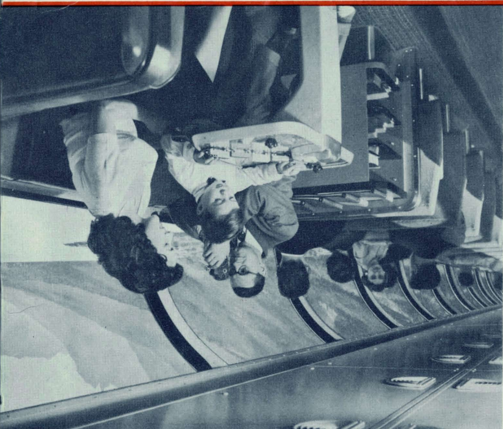
A lounge section—in the Great Dome! A place for happy hours enroute—seeing scenery, busy with games and other recreations.