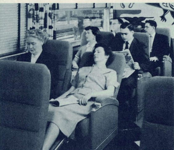
Below there's a comfortable reserved seat for each passenger. All seats recline.