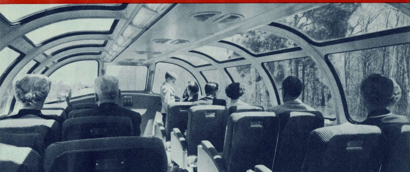
Plenty to see from a seat atop the coaches—and arching windows to make sight-seeing a thrill!