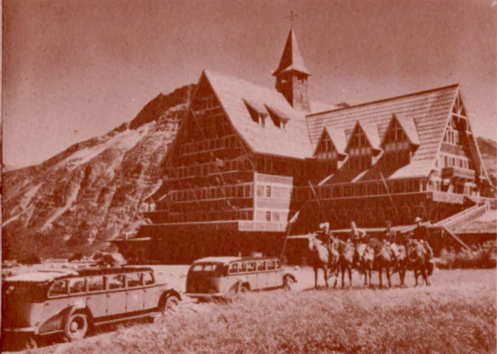
Prince of Wales Hotel in Waterton Lakes National Park, Alberta, Canada.

SUNDAY - A full day with meals and lodging at Prince of Wales Hotel. Time available for motor trip to Cameron Lake, golf, saddle horse or hiking trip.