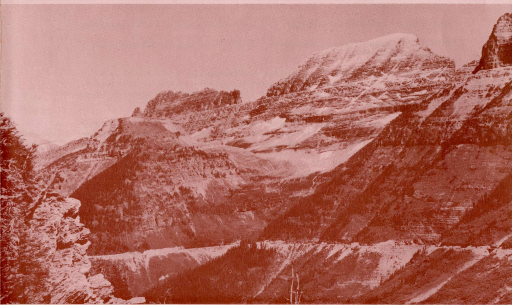
Garden Wall from Logan Pass — Glacier National Park in the Montana Rockies.

PRE-ARRANGED VACATION FOR INDEPENDENT TRAVEL - 1953