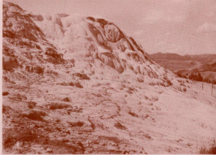
The Mammoth Terraces, unusual formations in Yellowstone National Park.

The following example Yellowstone - Glacier National Parks travel itinerary can be adjusted for any departure date during the park season. Tour features may be added or deleted as you wish. Consult your local travel agent for further information.