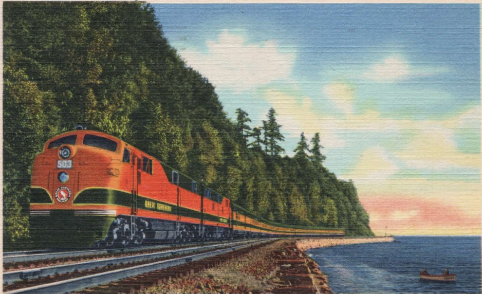
ALONG PUGET SOUND NORTH OF SEATTLE, WASH.