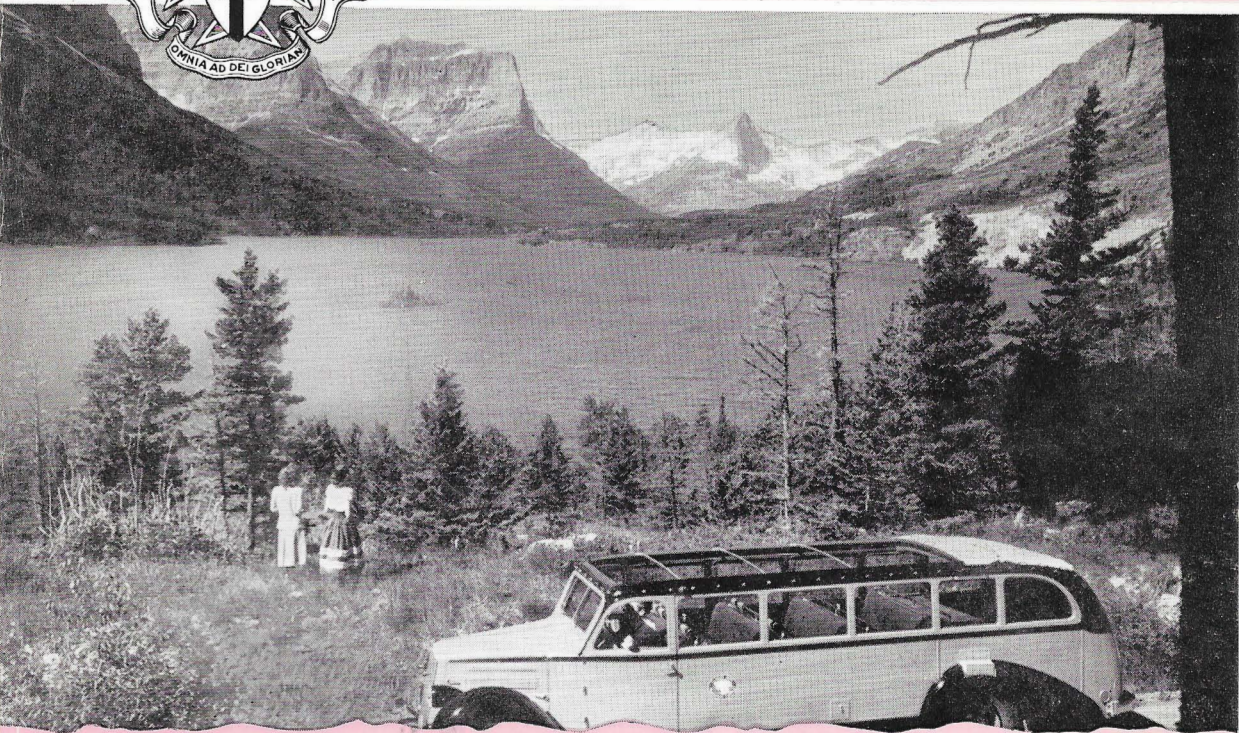
Lake St. Mary in Glacier National Park in the Montana Rockies