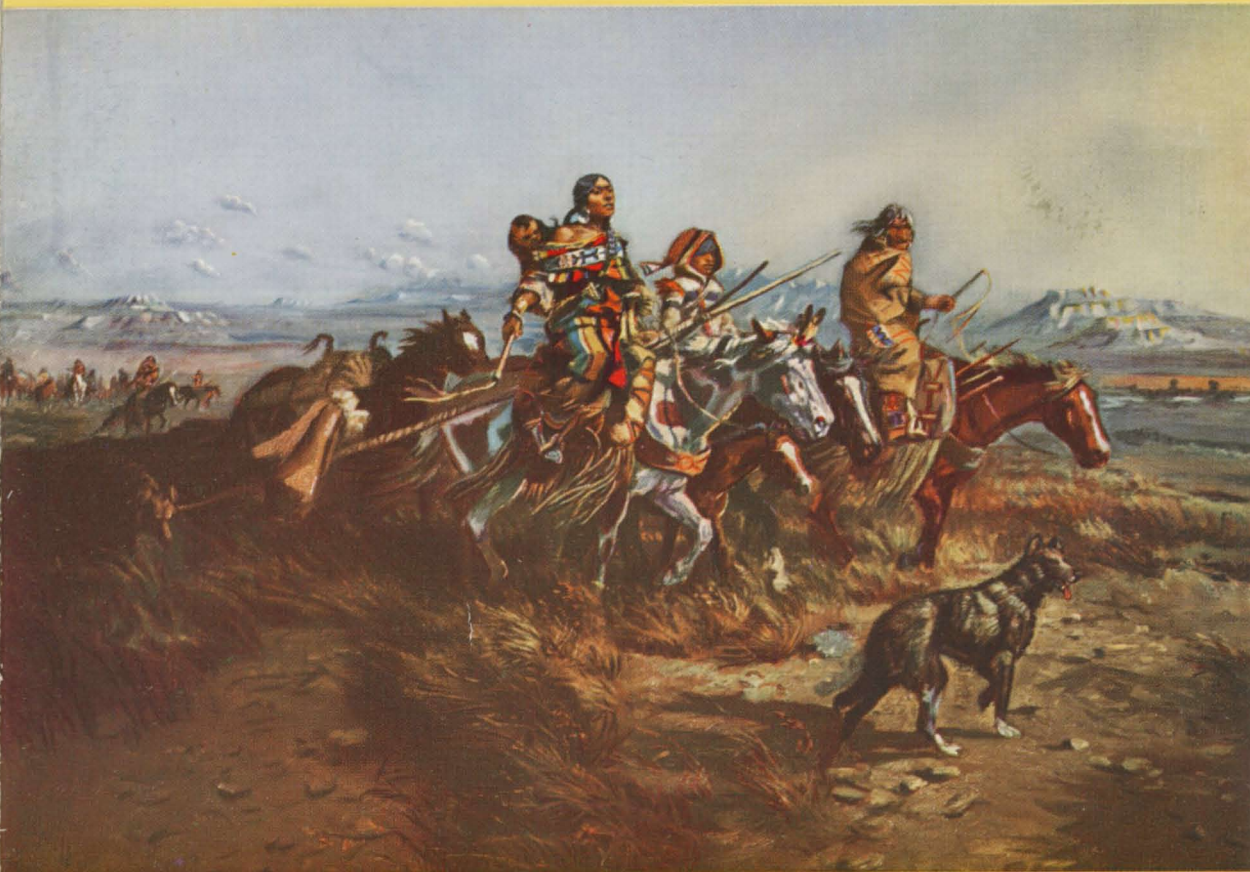
INDIAN WOMEN MOVING