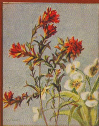
INDIAN PAINTBRUSH MARIPOSA LILY