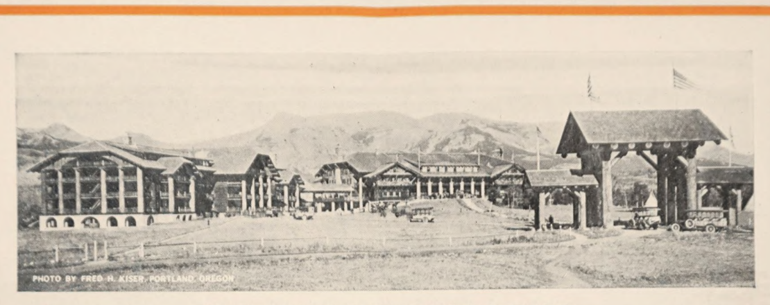
Glacier Park Hotel-Eastern Entrance to Glacier National Park.

E VERY trans-continental traveler by the Great Northern Railway should stop off at Glacier National Park. All tickets permit of stopover. Simply tell the Conductor; he will gladly give you detailed information.