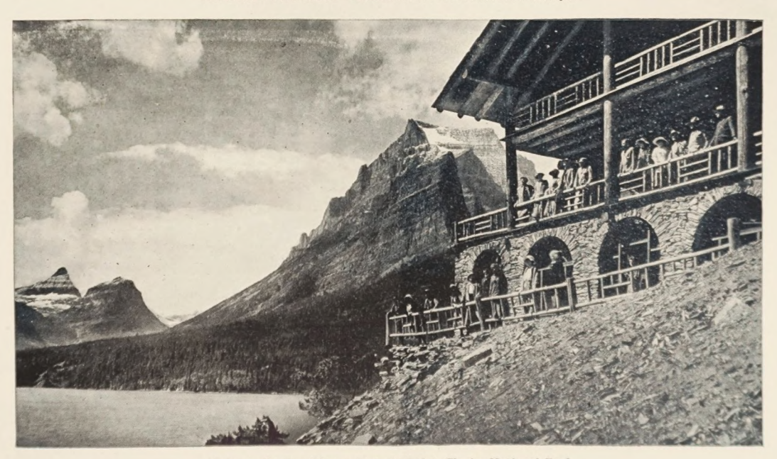
Going-to-the-Sun Mountain and Chalel, Glacier National Park.