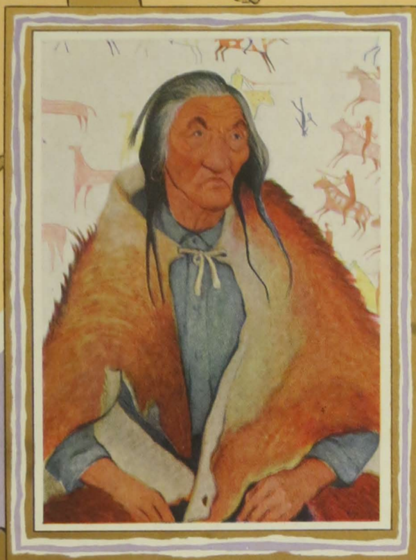
Chief Many-Tail-Feathers Glacier National Park