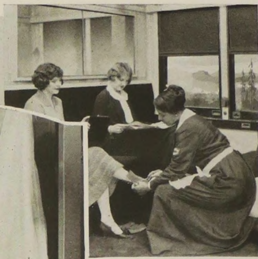
The ladies' maid is expert in caring for feminine needs

and cooking equipment. These commissaries are an extremely vital part of the Great Northern system, for through their efficient operation, their refrigeration plants and definitely established sources of supply, the dining car patrons are assured fresh, seasonable fruits, vegetables, sea foods and fish, also meats, poultry and dairy products, as well as the very best of staple groceries.