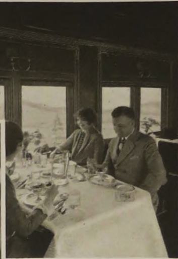
Attractive tables and beautiful surroundings add enjoyment to delightful meals

much of this train's extreme popularity.