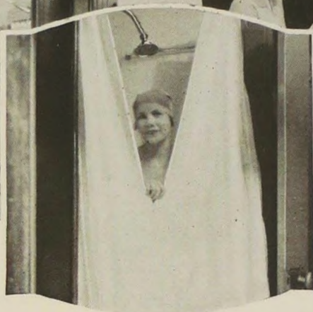
The women's shower is an innovation in train equipment