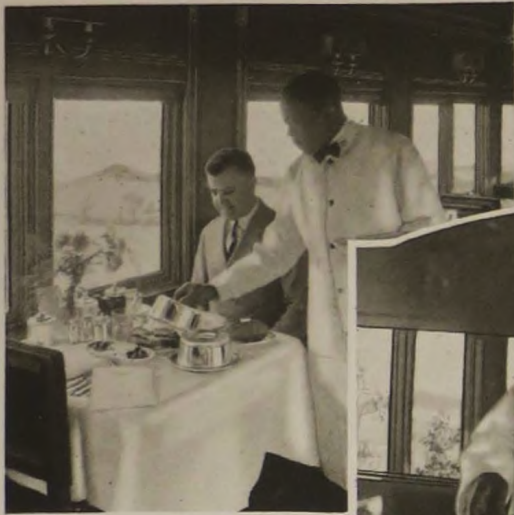
Perfectly cooked food is correctly served by competent crews on Great Northern diners