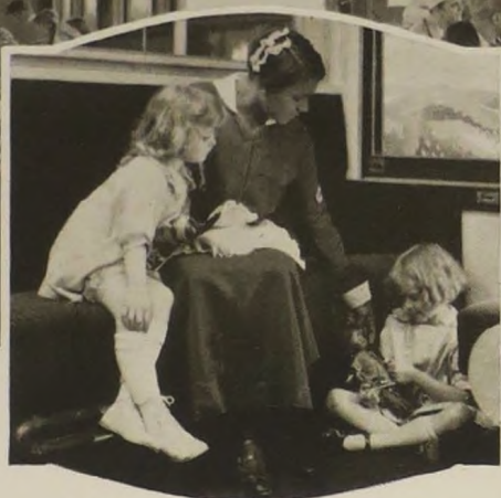
The nursemaid is a boon to mothers and a delight to children