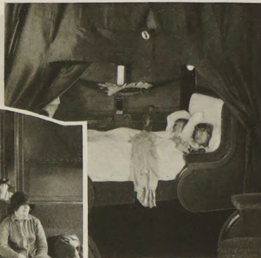
The berths are wide and roomy and conducive to sleep

THE anniversary of the New Oriental Limited marks not the end but the beginning of another period of increasing admiration on the part of the traveling public for this all-steel train.