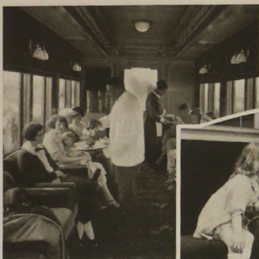
The serving of four o'clock tea is a pleasing afternoon function