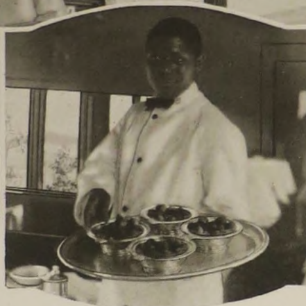
Seasonable fruits are served as fresh as though from the garden