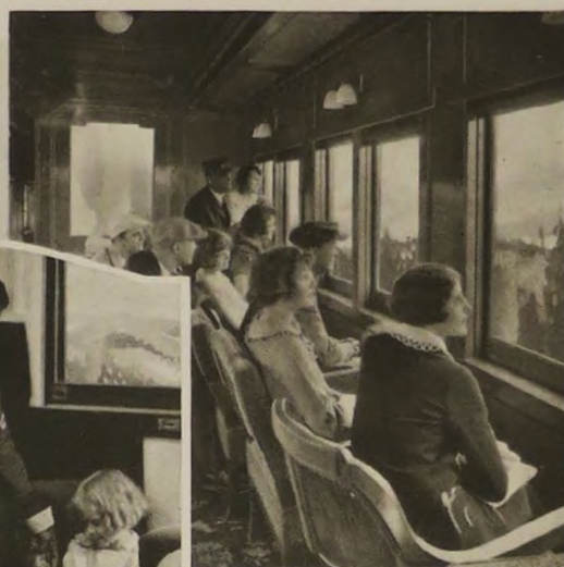
The high windows in the observation car permit an unrestricted outlook

The handsomely decorated dining cars, embodying all the service features of the best metropolitan restaurants, have been the source of much favorable comment on the part of even the most blasé travelers.