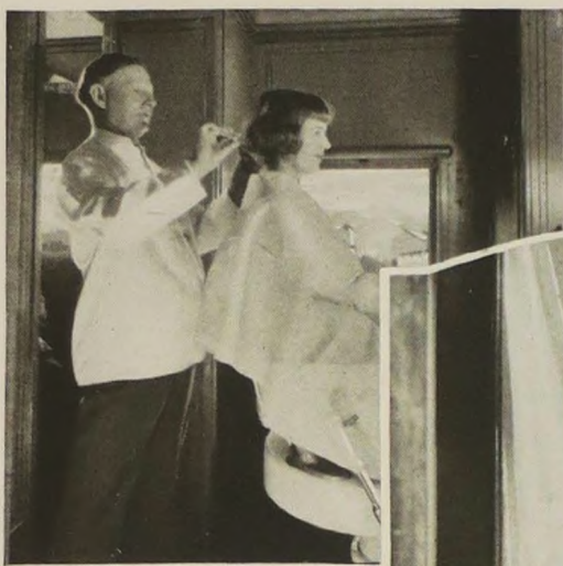
The barber is expert and versed in the modern modes of hair trimming