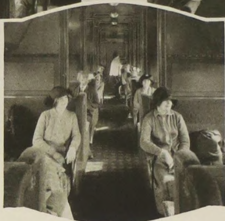
The permanent headboards insure privacy and prevent drafts