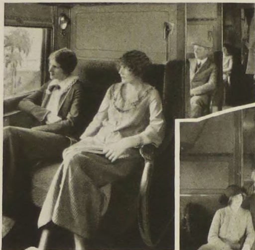
The compartments are attractive and restful