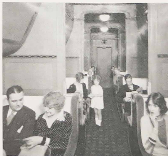
New Type Pullman Sleepers

In the making up of its menus the many "good