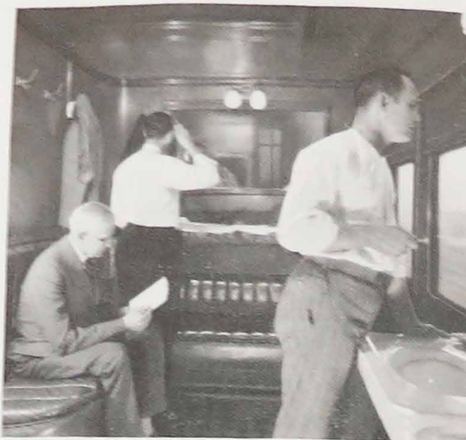
Men Appreciate the Commodious Wash Room on the Winnipeg Limited