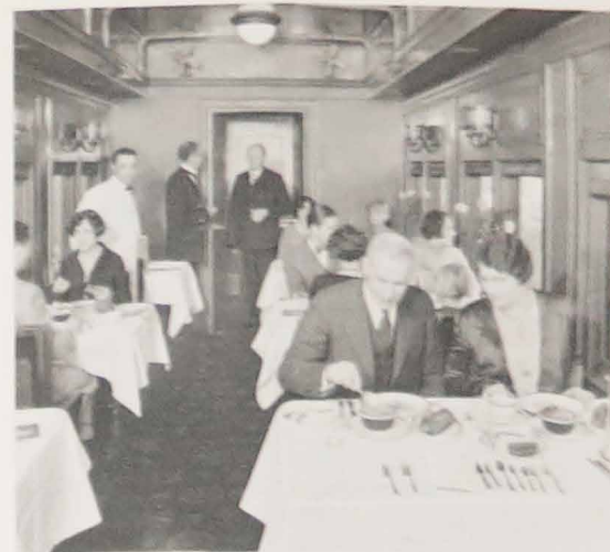
Great Northern Dining Cars Resemble a Smart Cafe

things to eat" that are native to the remarkable "Zone of Plenty" States, traversed by the Great Northern Railway, are utilized to the full. Firm and toothsome fresh water fish from the lakes of Minnesota, celery from the irrigated gardens of the Sun River district, Montana, big red apples from the fruitful Wenatchee Valley, Washington; St. Paul corn fed beef; "jumbo" potatoes from the lands between the Rockies and the Cascades; prize winning Minnesota butter—these are just a few of the appetizing "Zone of Plenty" edibles. There is a standard daily a la carte menu and in addition a "special today" menu varied from day to day and from meal to meal. Great Northern chefs have won a reputation second to none for excellent cuisine. Meals are served at surprisingly low cost. Whenever you travel to or from Winnipeg use the "Winnipeg Limited" and enjoy the travel comforts afforded by this splendid train.