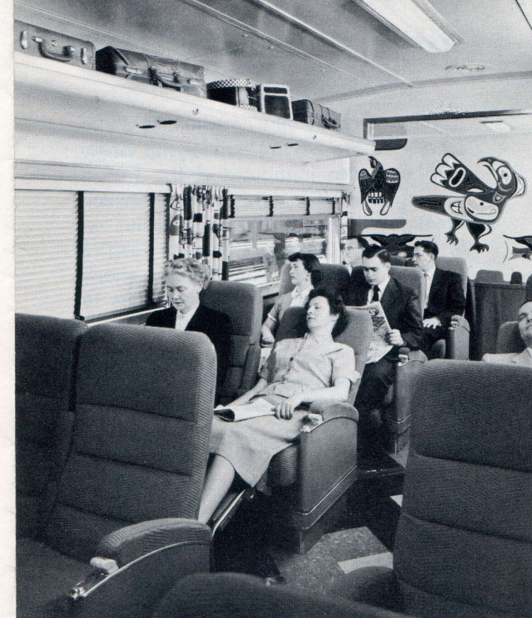
Luxurious reclining seats with leg rests are provided on a reserved basis for 46 passengers on the lower level of each Great Dome coach. The dome deck seats 24, and reservations are not necessary.

Panels of unique linoleum carvings from the Haida culture provide intriguing focal points of interest in each car's decor.