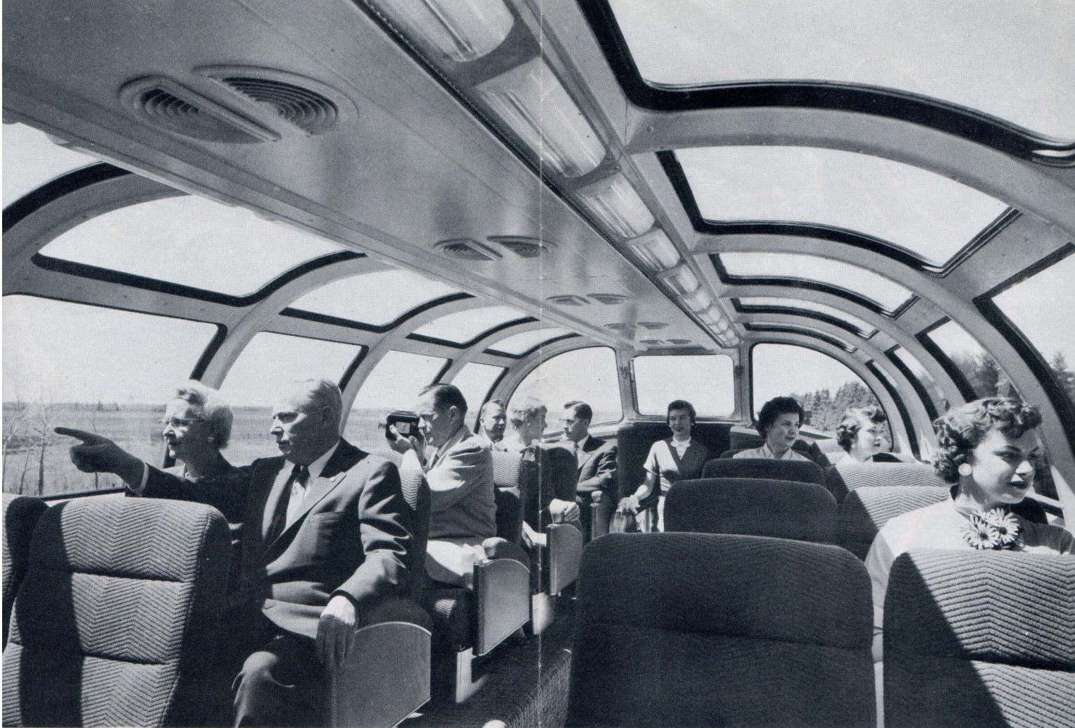
Sightseeing through big picture windows.