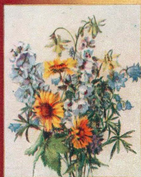
GLACIER NATIONAL PARK WILDFLOWERS