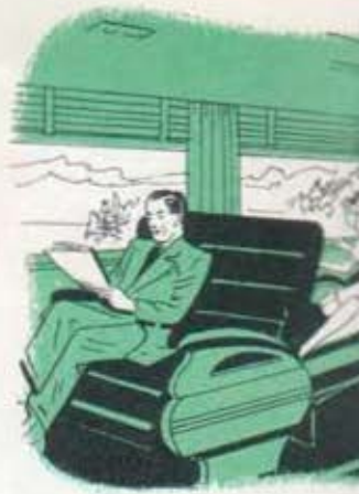
Reserved seat Day-Nite coaches with various reclining seats, motorized leg rests, new leg rests, at no extra charge.

The New Empire Builder offers a wide choice of accommodations between Chicago, via the Twin Cities, and the Pacific Northwest on a daily 45-hour schedule.