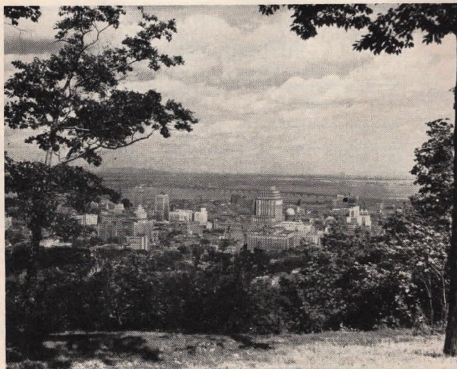
View of City of Montreal from Mount Royal