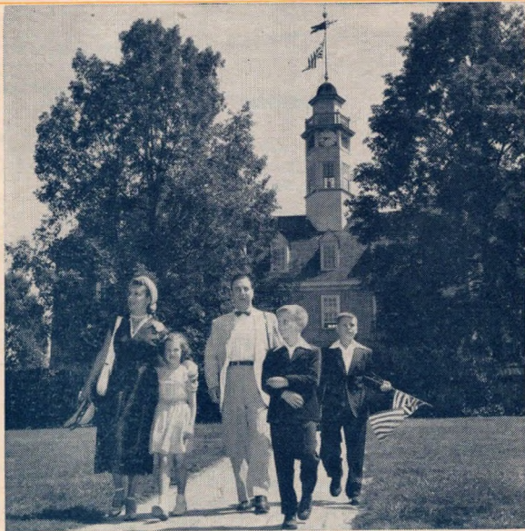
The Capitol in Historic Williamsburg

Williamsburg —Restored to approximately their appearance before the Revolutionary War, the many structures and gardens in Restored Williamsburg reflect the charm of early America. Unlike a museum or a stage setting, a visit to this one-time capital of Colonial Virginia is like turning back the clock and stepping into a world of two hundred years ago. There are streets, homes, halls that knew patriots like George Washington, Thomas Jefferson, Patrick Henry. Not far away are other shrines of historical importance: Jamestown Island, first permanent settlement of English people in America; and Yorktown where American independence was finally achieved with the surrender of Lord Cornwallis.