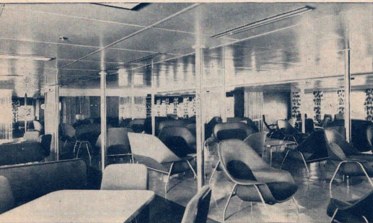
Lounge area in new C & O steamers

Automobiles are loaded and unloaded at ports by C&O steamer personnel. For folders and information, apply to your nearest A.A.A. Office or C&O Railway Ticket Office. Confirmed advance reservations recommended for automobile passage.