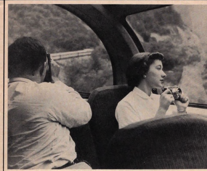
View of Beautiful Feather River Canyon from Vista Dome Chair Car

THE CALIFORNIA ZEPHYR features 'vista dome' Chair, Lounge and Observation cars from which all the beauty of the scenic Feather River Canyon and the Colorado Rockies may be seen. Sleeping Car accommodations consist of Drawing Room, Compartments, Bedrooms, Roomettes and Section space. All room accommodations have automatic controlled heating and air conditioning, also individual radio control. Dining Car furnishing fine foods expertly prepared at attractive prices. Evening dinner reservations for convenience of sleeping car and chair car patrons. No standing in line! Buffet Club Car serving sandwiches and refreshments (Vista Dome atop this car for use of sleeping car passengers). Vista Dome Lounge Observation Car with cocktail lounge serving refreshing beverages. The Vista Dome CALIFORNIA ZEPHYR offers the finest in appointments and design with outstanding mechanical features for your comfort enroute. A truly magnificent train between San Francisco and Chicago, with daily through sleeping car between San Francisco and New York.