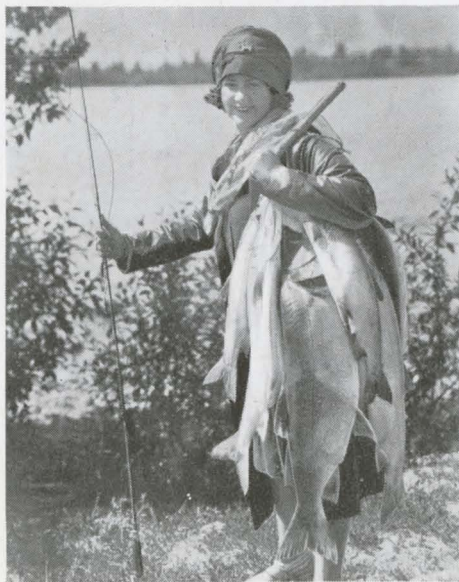
A FISHERWOMAN'S PARADISE