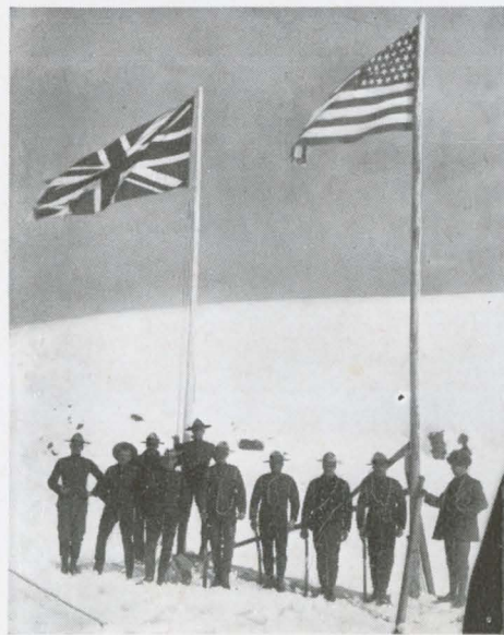
THE IMAGINARY LINE