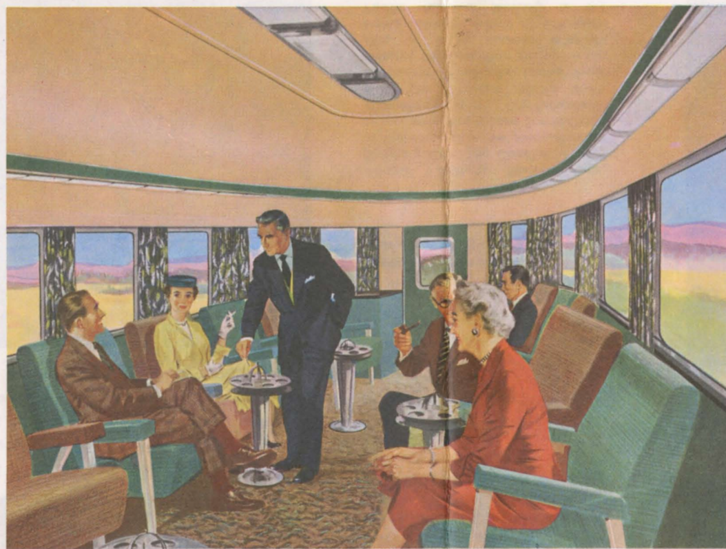
Main Lounge of the "Park" Observation-Lounge Cars features decor, comfortable chairs, attractive surroundings.