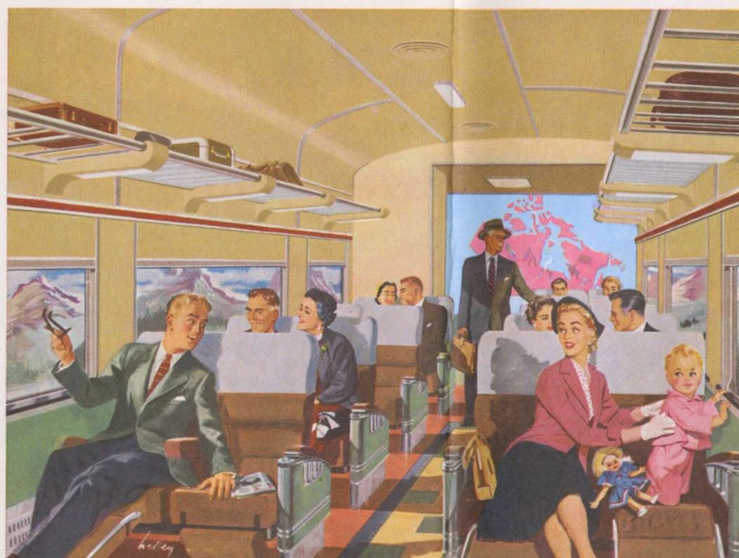
Reclining seats with full-length leg rests — highlight economical travel in the deluxe Coaches on "The Canadian" and "The Dominion".

Holiday country in Canada includes the North Shore of Lake Superior; the Lake of the Woods in Ontario; lakes, rivers, fish and game areas in the Prairie Provinces of Manitoba, Saskatchewan and Alberta; the magnificent playgrounds of the Canadian Rockies — Banff, Lake Louise, Emerald Lake, the Columbia Icefield, Revelstoke; the Thompson, Columbia and Fraser Valleys; British Columbia, a sportsman's paradise, forested, game-filled — with a seaboard coast fringed with islands. Many Canadian cities grace the longest dome ride in the world. Cosmopolitan Montreal, metropolitan Toronto, the nation's capital at Ottawa, Sudbury, the lakehead ports of Port Arthur and Fort William, Kenora; the prairie cities of Regina, Winnipeg, Moose Jaw, Medicine Hat, Canada's oil center at Calgary, beautiful Banff and Lake Louise in the Canadian Rockies, and Vancouver on the Pacific.