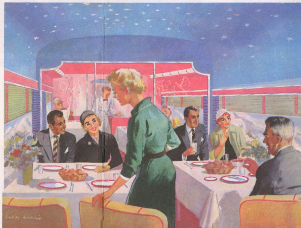
Distinctive Canadian cuisine is enhanced in the Dining Room cars of "The Canadian" and "The Dominion" by these uniquely attractive surroundings.