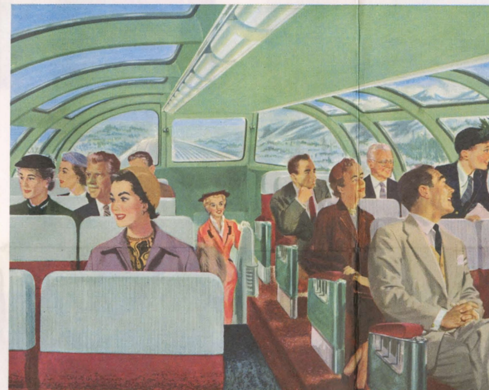
Tinted, glare-proof glass makes the air conditioned upper level Scenic Domes of the "Park" Observation Lounge and "Skyline" Coffee Shop cars ideal for transcontinental sight seeing.