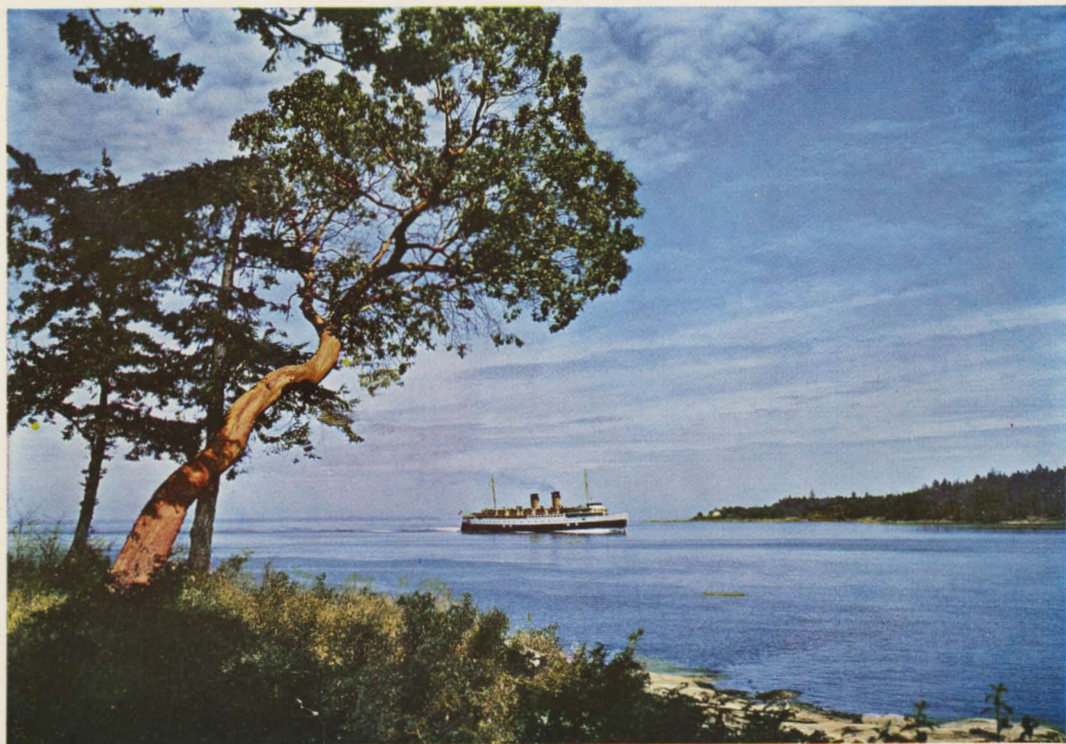
Active Pass, B.C.