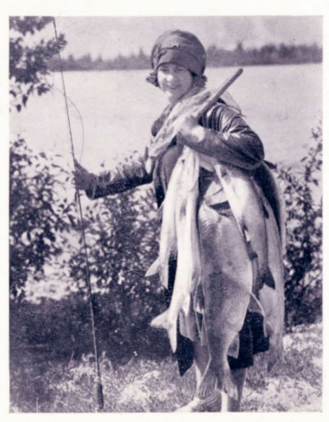
A FISHERWOMAN'S PARADISE