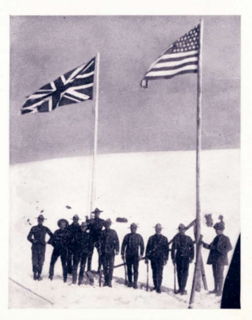
THE IMAGINARY LINE