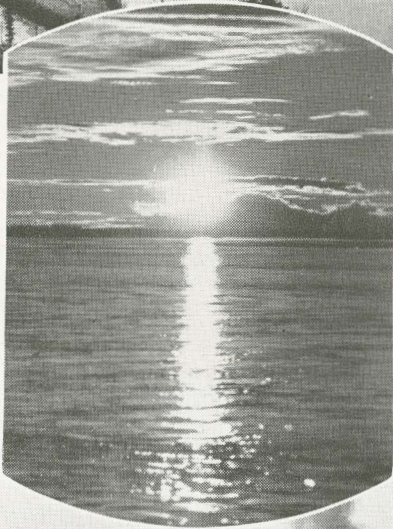
Left— In the Land of the Midnight Sun