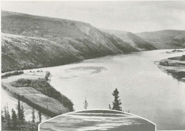
Left— The Peaceful Yukon below Dawson