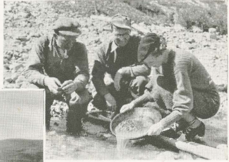
Right— Panning gold in the Klondyke