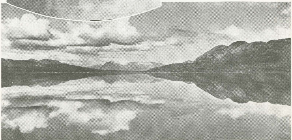
Reflections in West Taku Arm