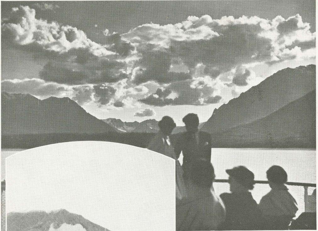
View from Lake Steamer Enroute to West Taku Arm