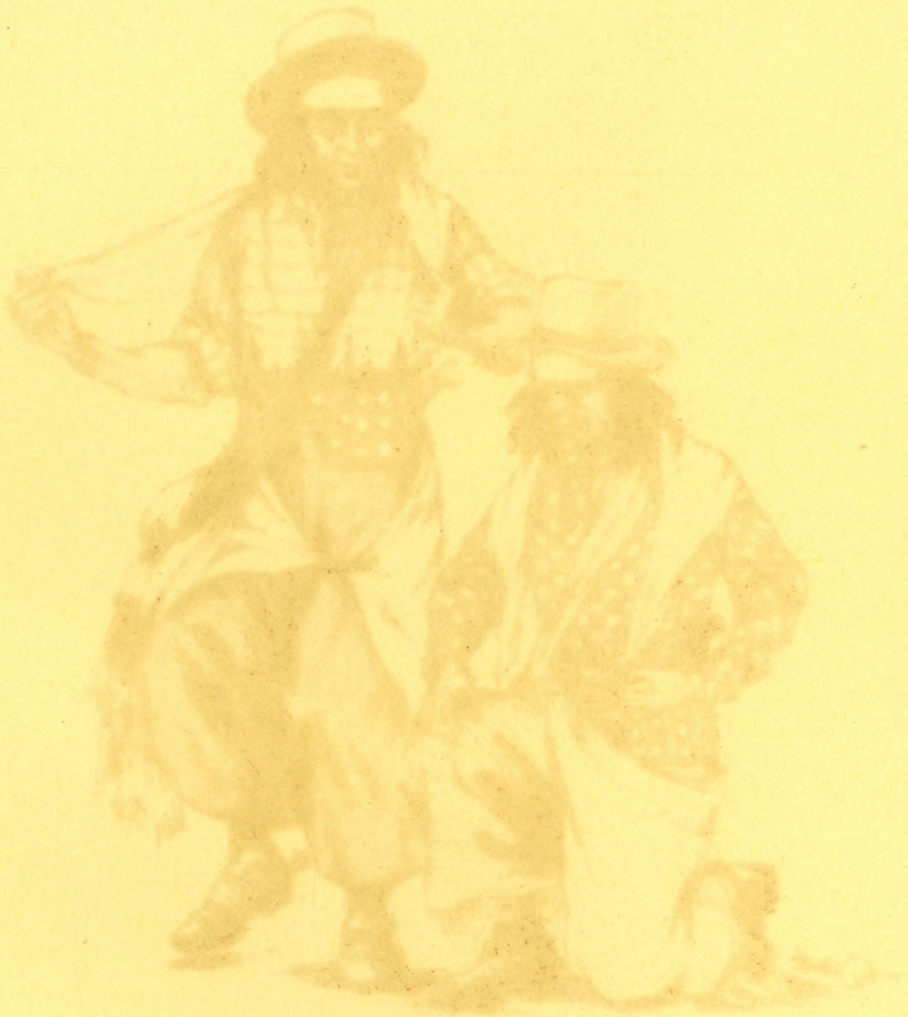
THE TWO BROTHERS OF THE MOUNTAINS