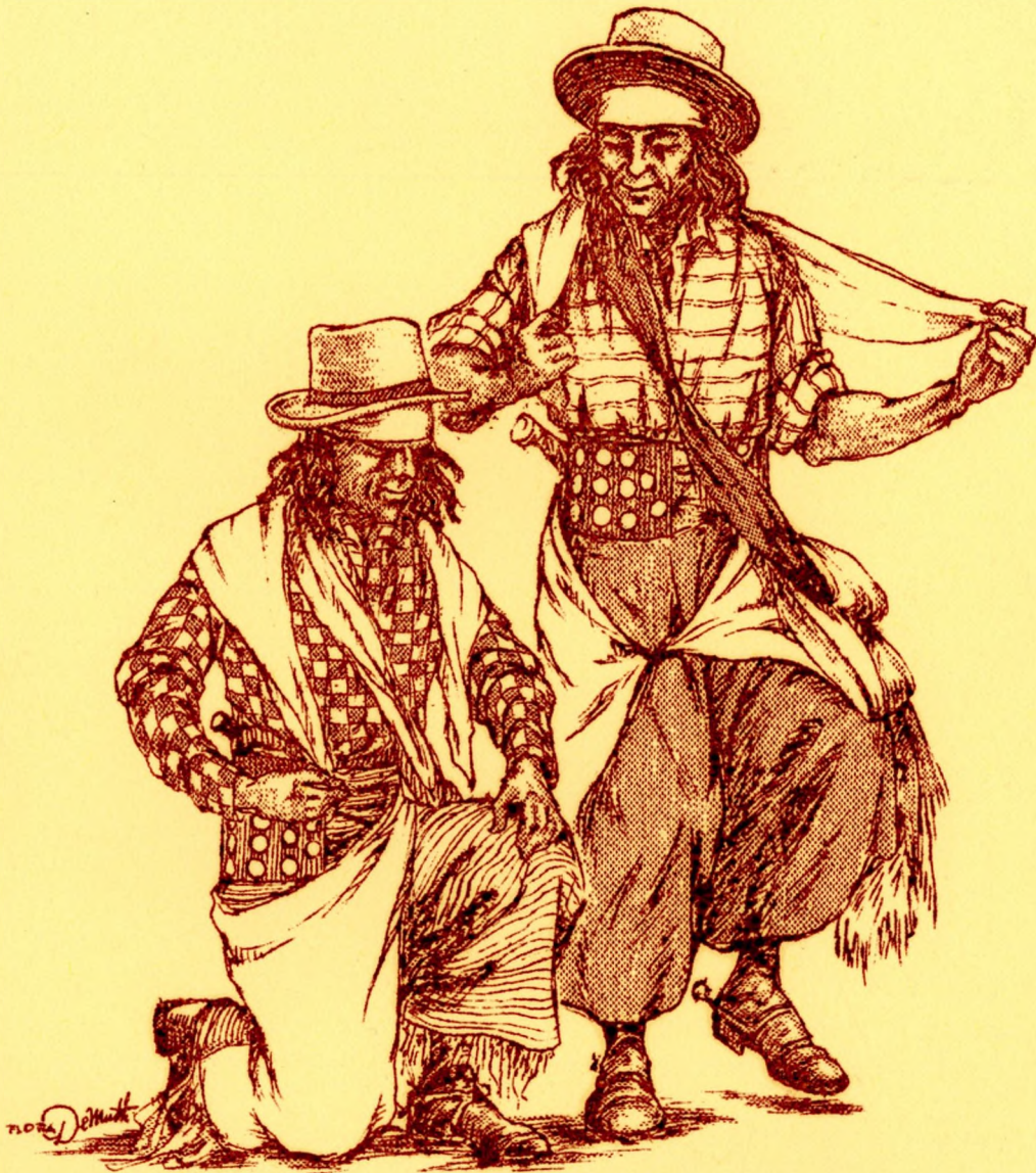
GAUCHOS OF THE ARGENTINE... BUENOS AIRES