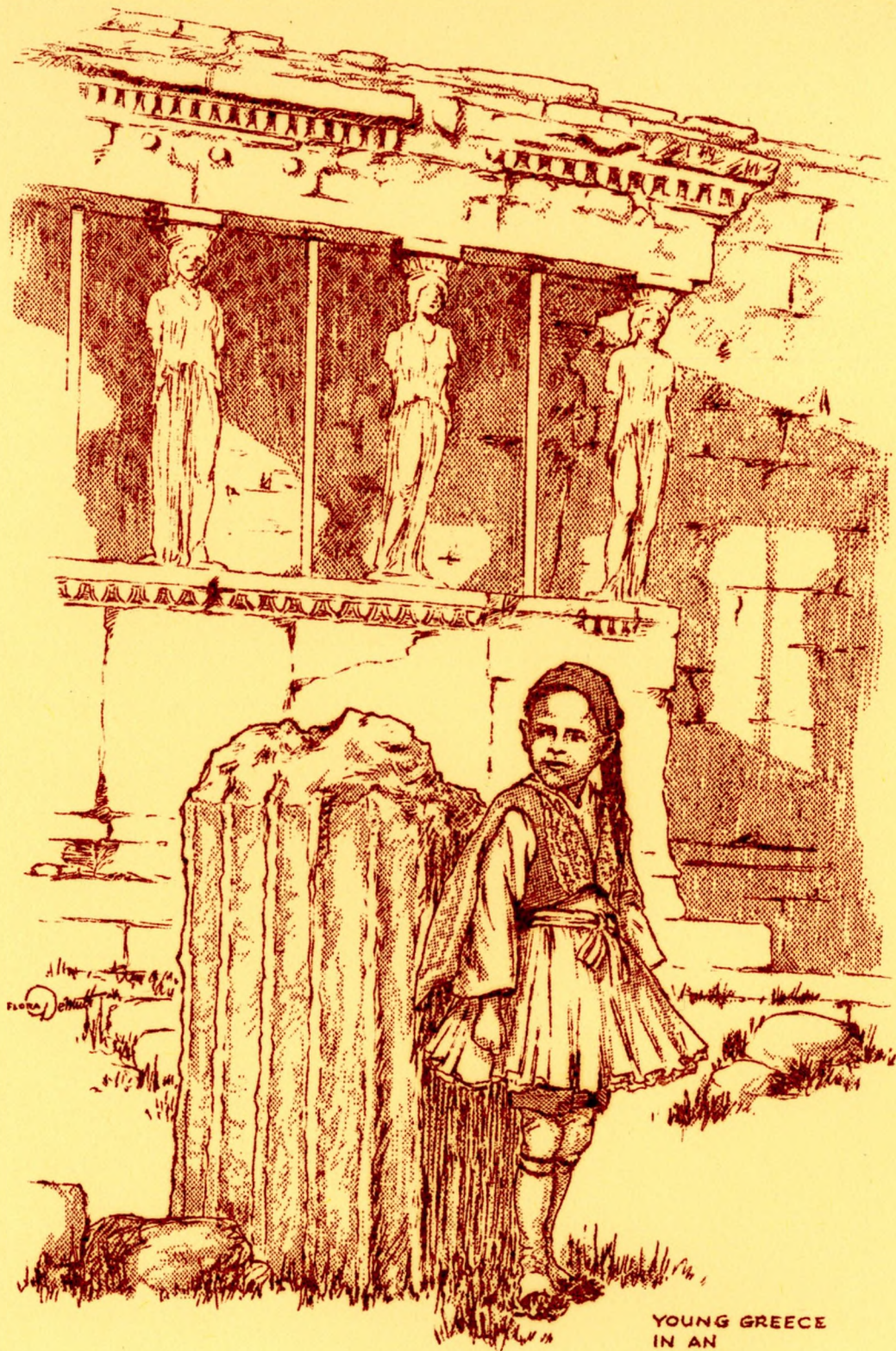
YOUNG GREECE IN AN ANCIENT SETTING