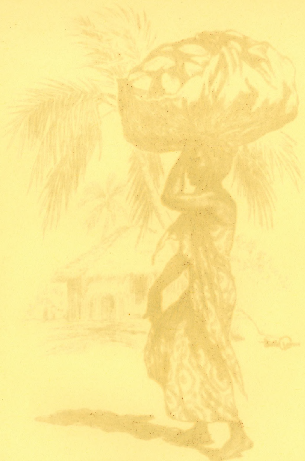
THE GIRL WITH THE COCONUTS A GENERAL VIEW