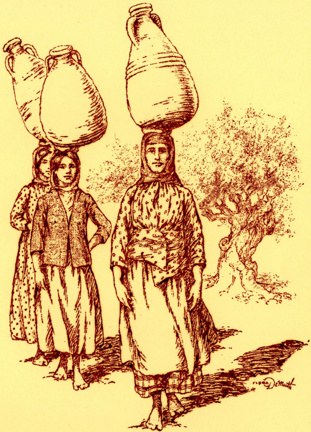
COMING FROM THE WELL PALESTINE