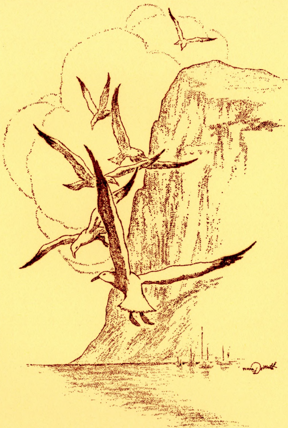
GULL'S WHEEL ABOUT THE ROCK'S GRIM FACE GIBRALTAR