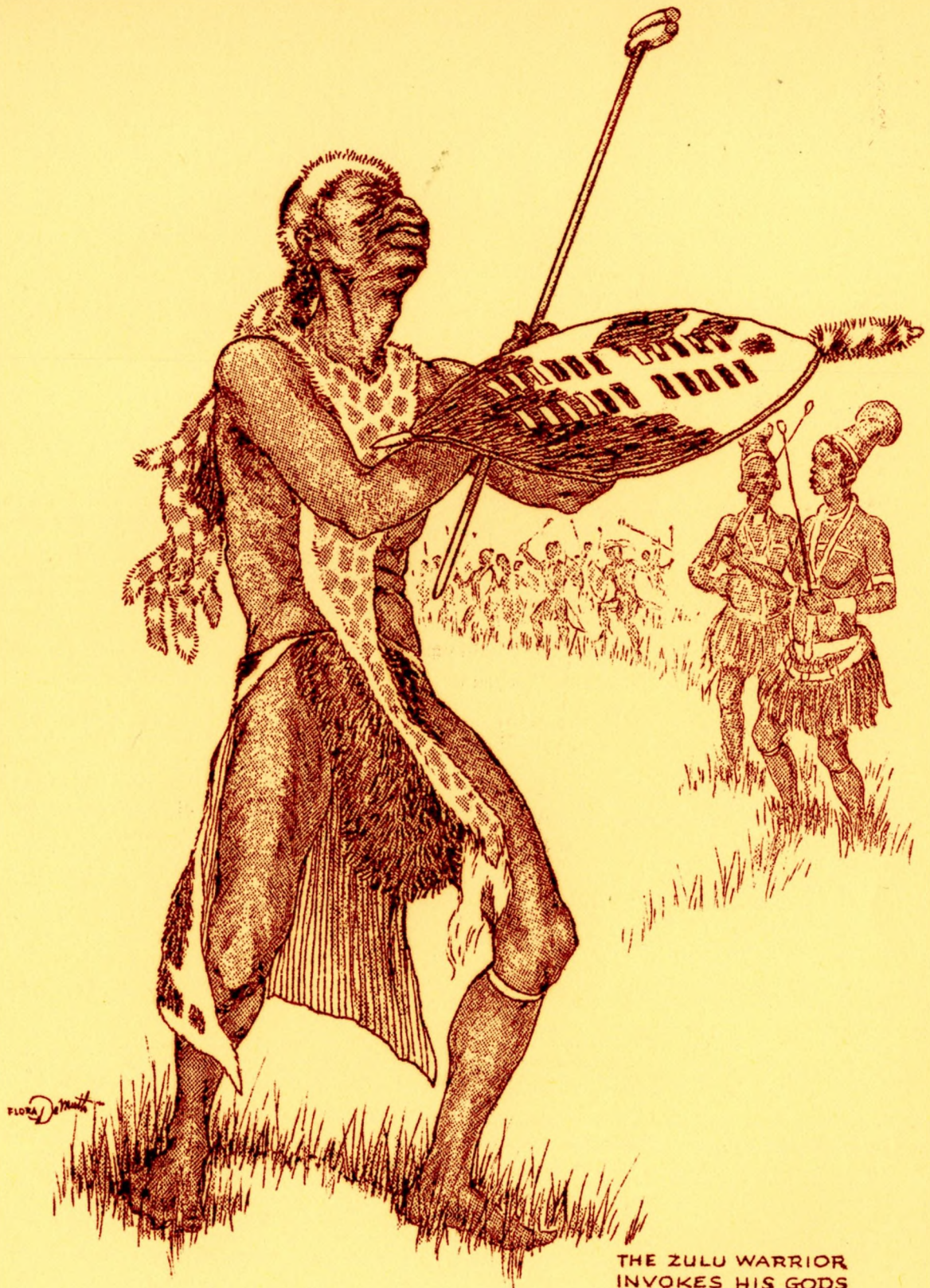
THE ZULU WARRIOR INVOKES HIS GODS