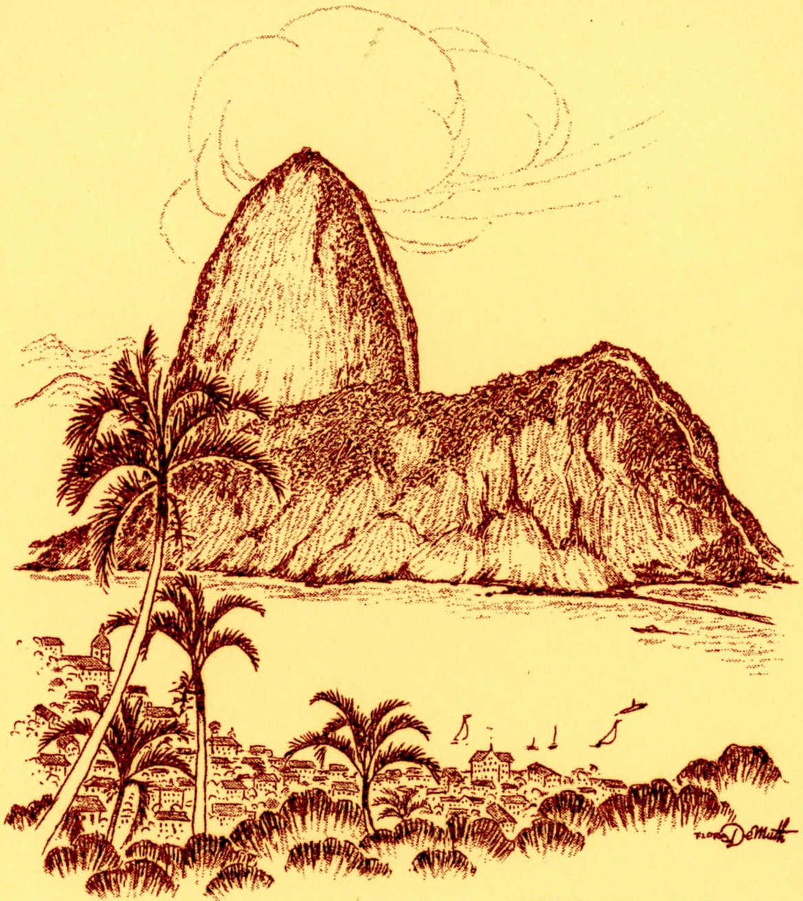
LOFTY "SUGAR LOAF" BOTAFOGO BAY RIO DE JANEIRO