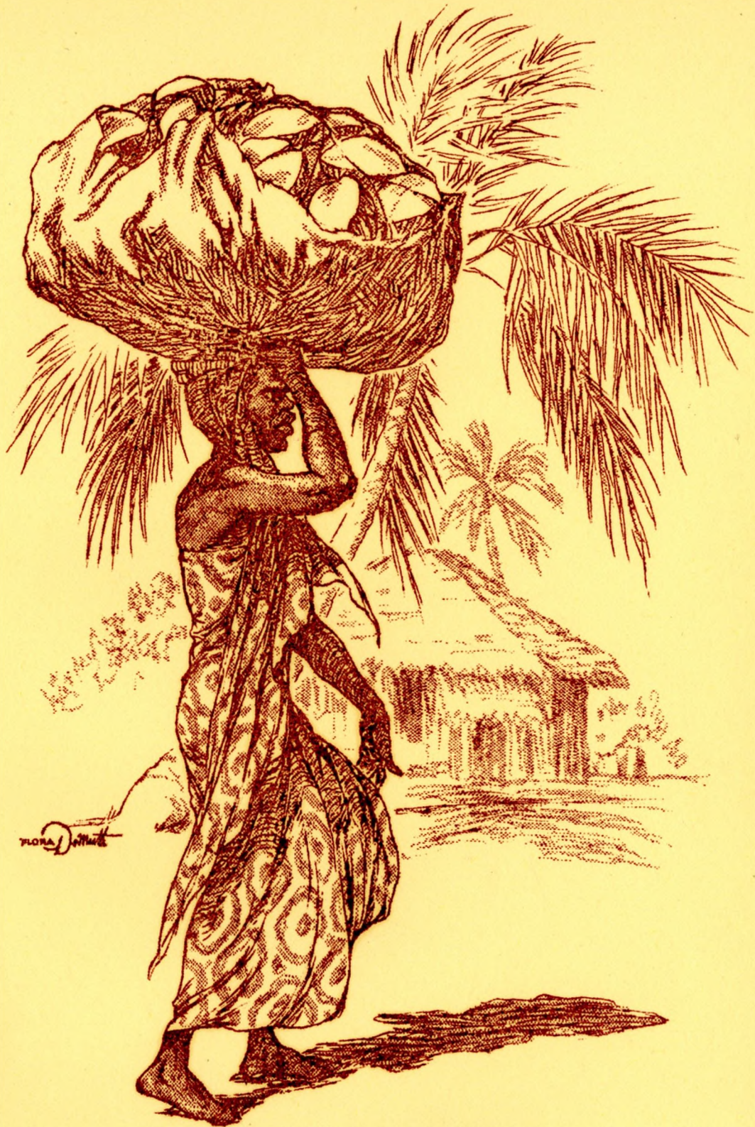
A GENEROUS LOAD OF COCONUTS ZANZIBAR